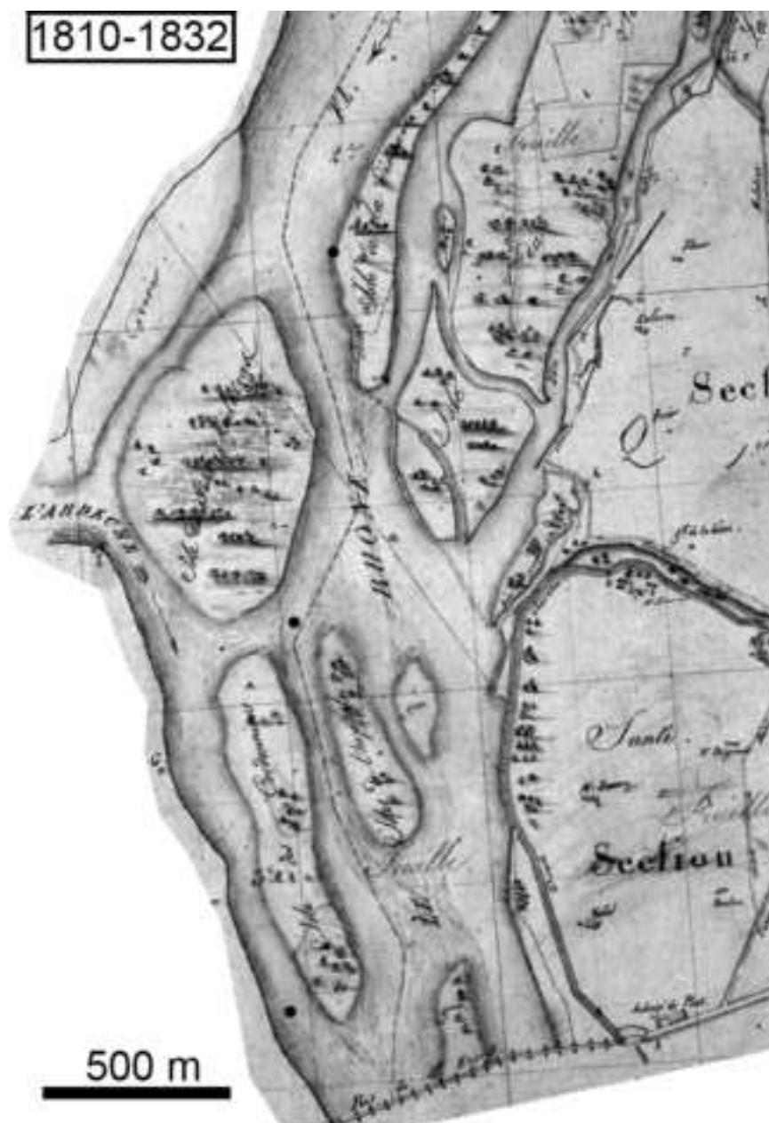
Cadastral map