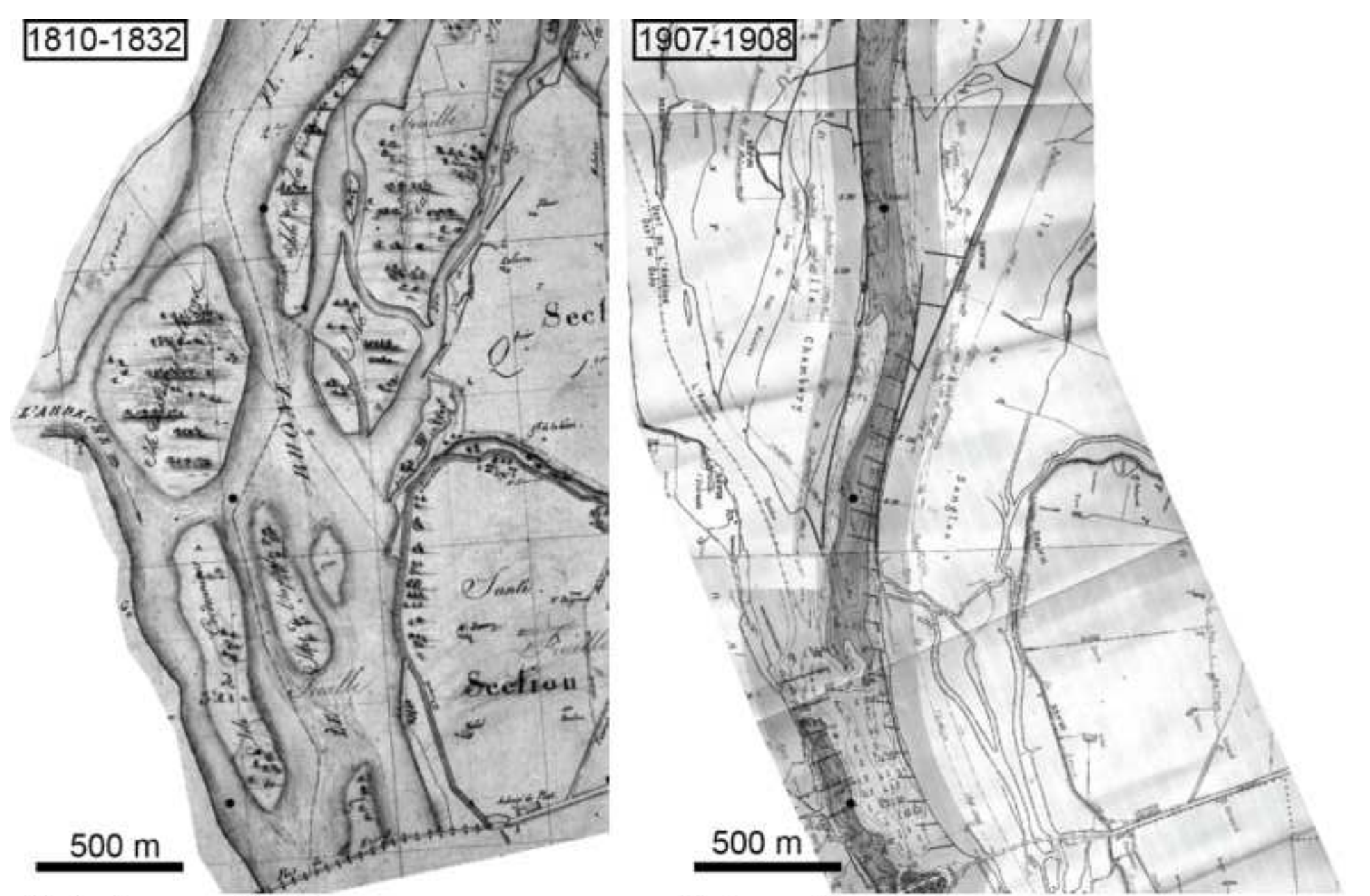
Cadastre napoléonien (Archives départementales du Vauciuse)