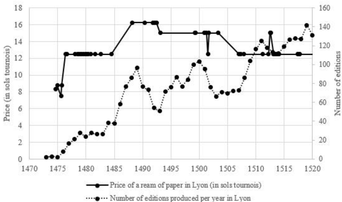
Fig. 2: Evolution of the price of paper compared to that of printed production in Lyon between 1470 and 1520