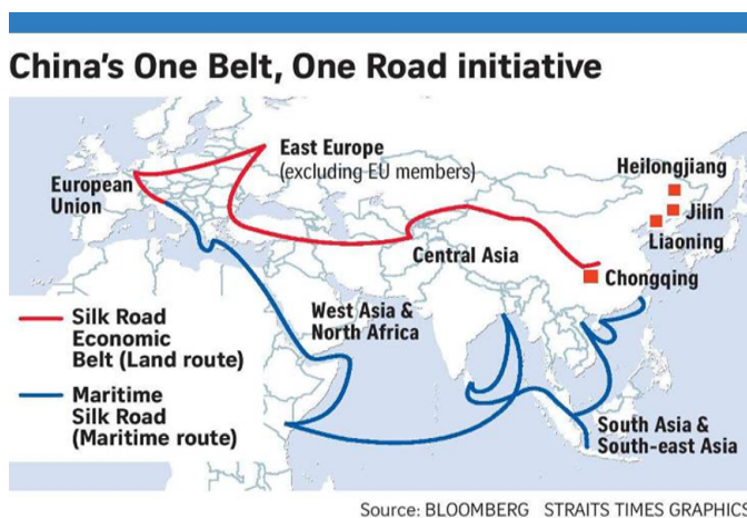
Figure: Map showing China's One Belt, One Road Initiative

BRI consists of two mega projects: Silk Road Economic Belt and a New Maritime Silk Road. These two projects were unveiled and inaugurated by President Xi in September 2013 in Kazakhstan and October 2013 in Indonesia respectively. These potential notions paved the way for an inclusive, mutually beneficial and cooperative ventures of land and sea-based economic and trade corridors connecting Asian with the Eurasian and European markets (Swaine, 2015). Under BRI, China has endeavoured to build a web of roads and railway networks along with pipelines, fibre optics and communication networks across the 11,000 km of the Eurasian continent (Farwa & Siddiq, 2017, p. 83). Another part of the BRI, 'the 21st Century Maritime Silk Road' has envisioned to connect China with the seashores of major regions like South East Asia, South Asia, North Africa, Middle East and Europe through sea passages of South China, Indian Ocean, Arabian Sea and the Mediterranean Sea (Farwa & Siddiq, 2017).