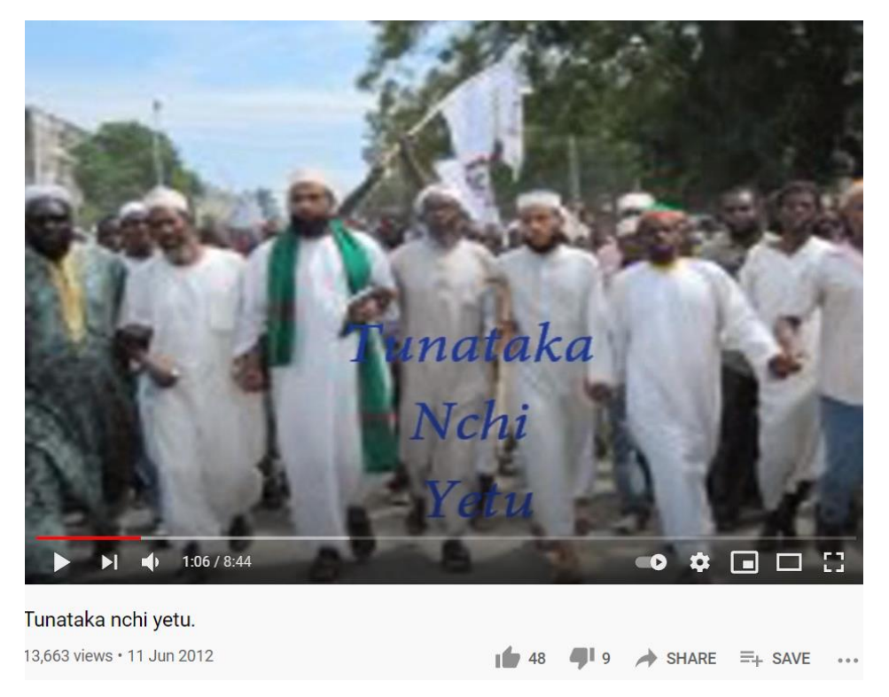
Image #2: Another image of the UAMSHO leaders used by the video. This was during the UAMSHO peaceful march in May 2012 before they were arrested.