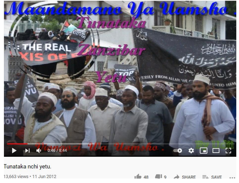
Image #1: The images of UAMSHO Sheikhs that feature in the 'Tunataka Nchi Yetu' video.

Music videos mix pictures, sounds and words to convey a message. The two videos of the song, uploaded in 2012 and 2015, both use symbols and pictures to express nationalism. In the video uploaded in 2012 for example, in the introductory verse, the song uses the images (See image #1 and #2) of the UAMSHO incarcerated Islamic Sheikhs. The UAMSHO group embodies Zanzibari nationalism and defended Zanzibar's demands for 'nchi yetu'.