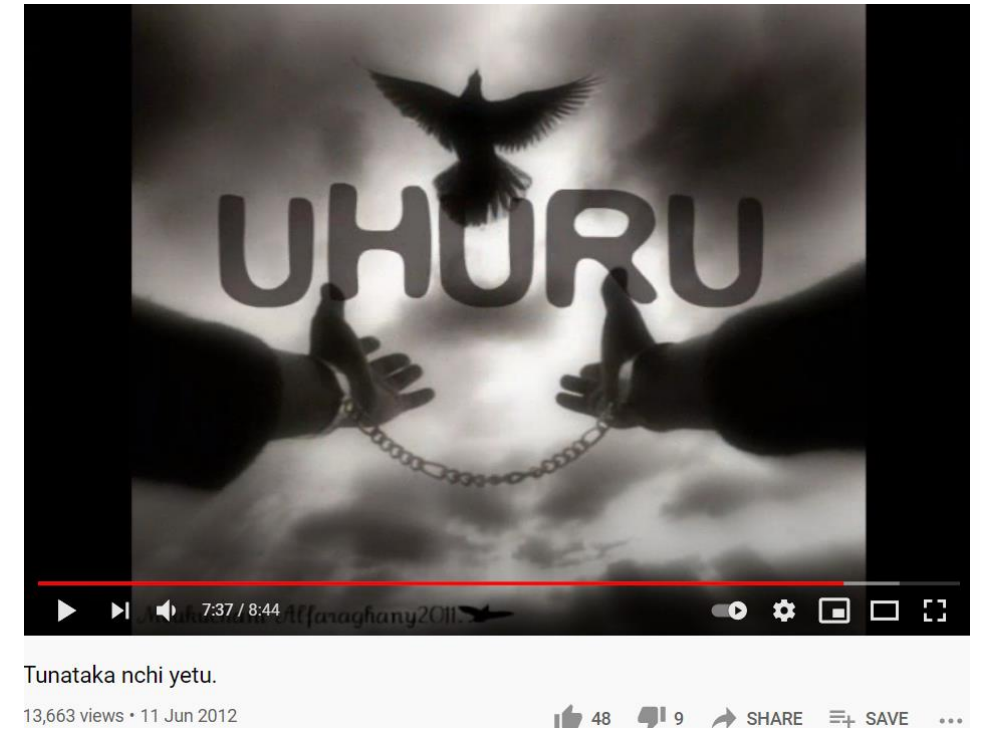
Image #4: Towards the end, the video uses the image of chained hands with a dove with the words ' Uhuru ' (freedom).

The song also uses images of the reconciliation (Maridhiano) between the CCM and CUF political parties (Image #3). The video also repeatedly uses the images of Seif Sharif Hamad of CUF and Amani Karume of CCM shaking hands in 2009, the culmination of the peace talks that gave birth to the Government of National Unity (GNU) in 2010. These famous images in Zanzibar that have been seen multiple times on TV, in the newspaper and in social media represent the imagining of a united Zanzibar that would idealize the vision of a sovereign nation. Another visual is that of chained hands with the words 'Uhuru' (freedom) and a dove—an international symbol of peace (Image #4). These images reinforce the idealization and imagining of a peaceful nation of Zanzibar.