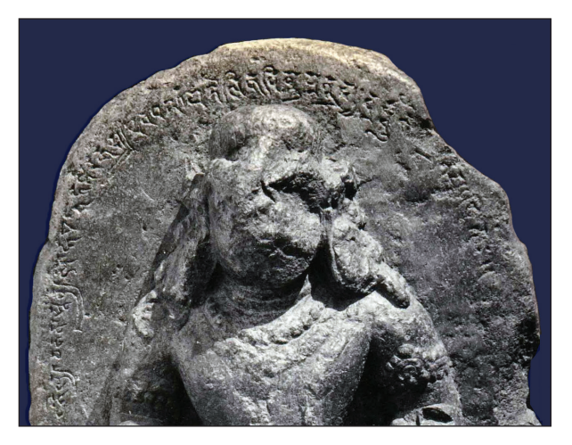
PLATE 4: Details of location of the inscription