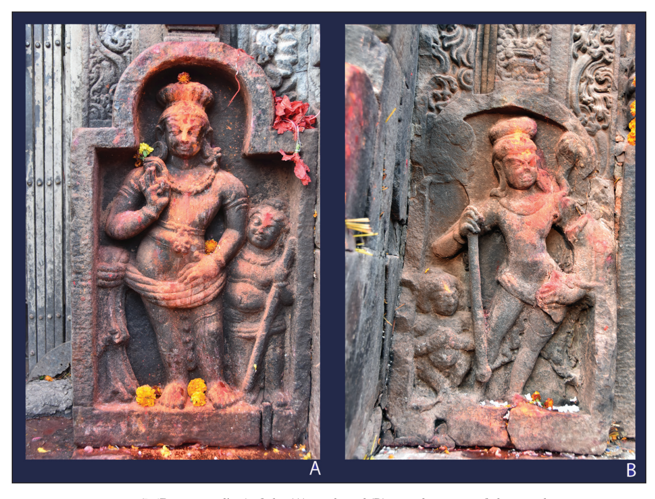
PLATE 7: 'Door guardian' of the (A) south and (B) west doorways of the temple at Mundeshwari, Bihar

The references and evidences cited above perhaps clearly demonstrate that this male figure bore a generic iconographic programme over a vast geography and chronology ranging over a millennium. In most of the cases the images of this deity are found in association with the gods of direction and are found in the niches of