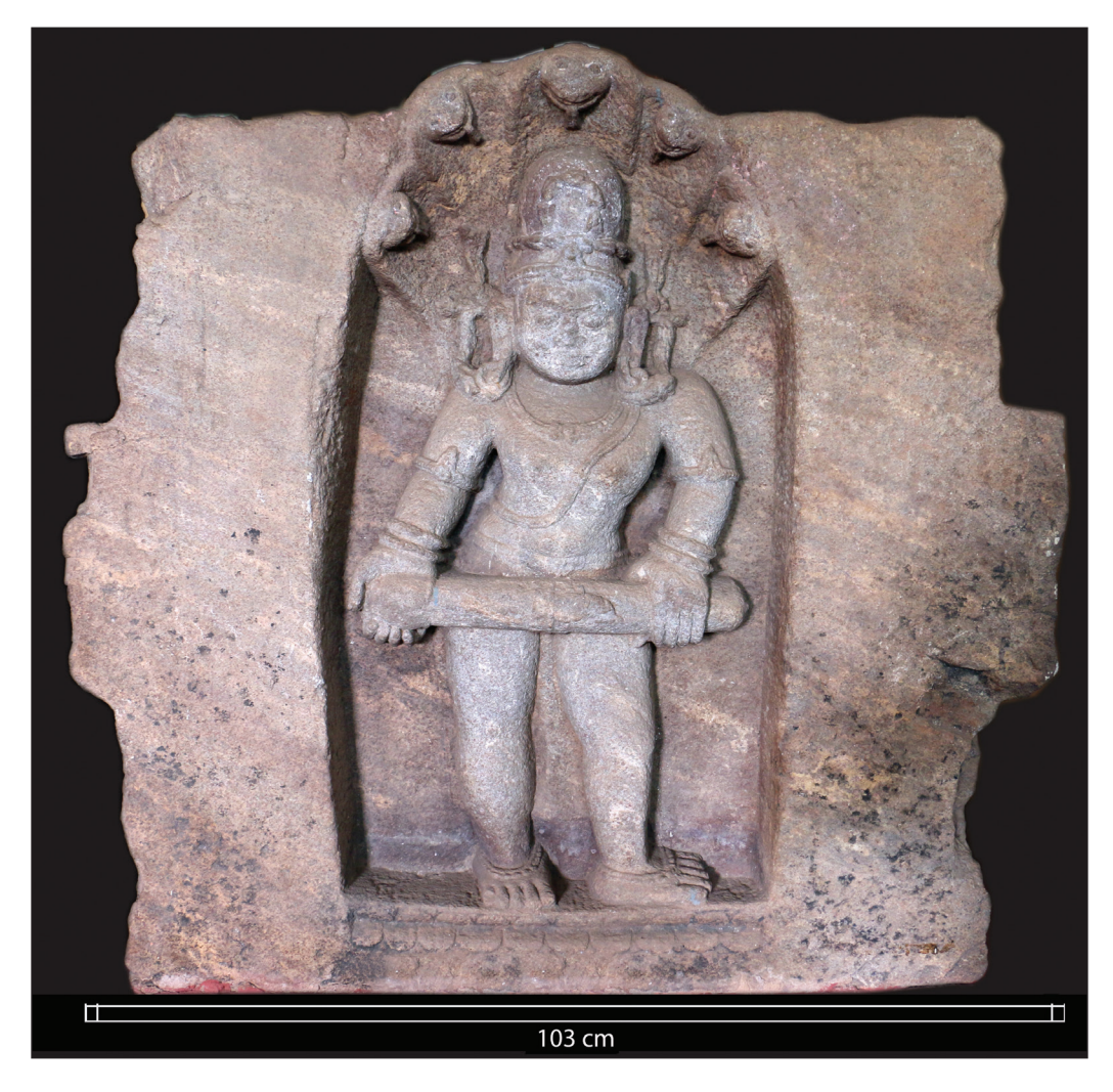
PLATE 8: Male deity from the Lalitgiri area of Odisha holding staff in hand horizontally

temple walls. Interestingly enough, the image under review is not part of any architectural composition. This was carved by its artist as an independent portable image to be enshrined as a principal deity. The kneeling donor figure depicted by the side of his feet clearly conveys the message that he held the status, as early as seventh century in some parts of Bihar, of a deity who was donated and venerated by the donor-devotee who engraved his name on the sculpture. Irrespective of the possibility of the deity being identified with Daṇḍanāyaka/Daṇḍapāṇi of the Purāṇas, his considerably high degree of cultic popularity is unquestionable.