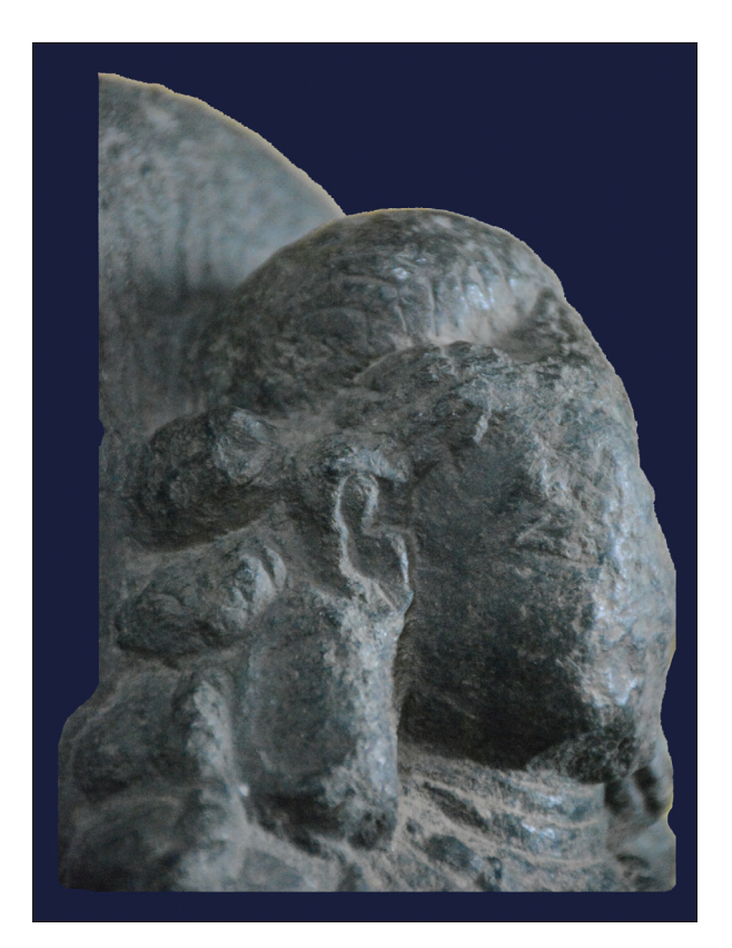
PLATE 2: Temporal view of the face showing details of the headdress and hairstyle