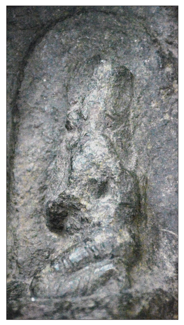
PLATE 3: Details of the donor figure