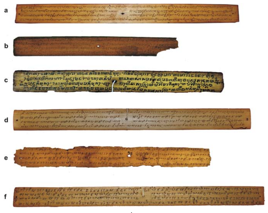
FIGURE 2 Source Manuscripts. a. San Hyan Śāsana Mahāguru (PNRI L 621); b. San Hyan Śāsana Mahāguru (Ciburuy Kropak 26); c. Bhīmaswarga (PNRI L 455); d. Bhīmaswarga (PNRI L 623); e. Bhīmaswarga (lontar Ciburuy VII); f. San Hyan Swawarcinta (PNRI L 626). NATIONAL LIBRARY OF THE REPUBLIC OF INDONESIA.

that L 455 was acquired from Mt Merbabu, the writing material indicates the possibility alluded to earlier, namely that the manuscript was originally produced in West Java before ending up in the Merbabu manuscript trove.