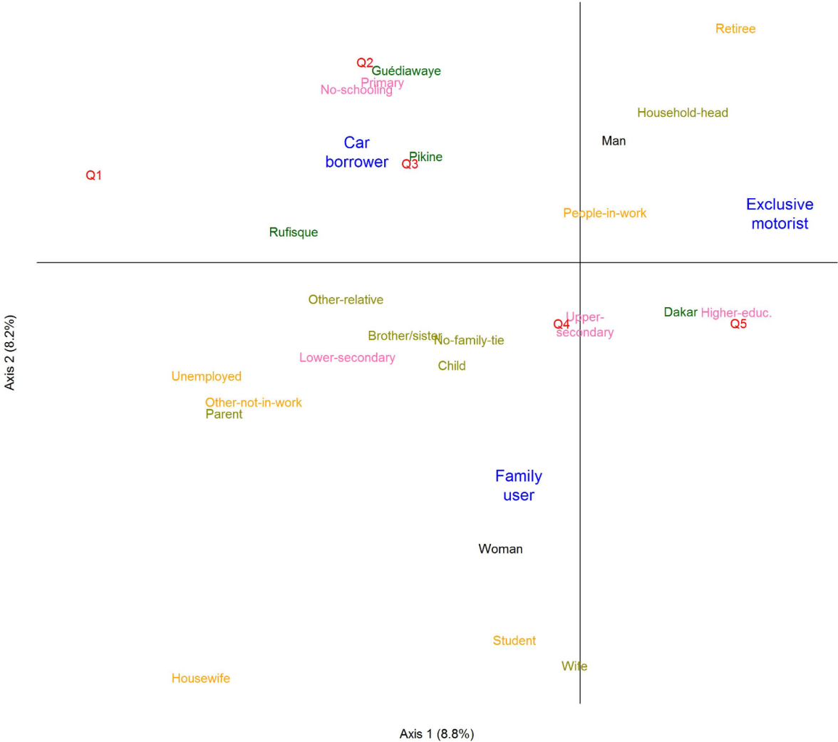
Figure 2. First plane of the multiple correspondence analysis for three categories of car users and a variety of characteristics at the personal* and household level**, in 2015

difficult." In the fifteen year period, the relative size and composition of the group changed little. The general rise in the level of education in Dakar is reflected in the increase in the proportion of individuals with tertiary education qualifications and, in line with this, of the children of the head of household. At the other end of the age pyramid, the ageing of the Dakar population (ANSD, 2014) leads to a greater presence of retirees. However, in 2015 exclusive motorists in Dakar were essentially wealthy, economically active, household heads.