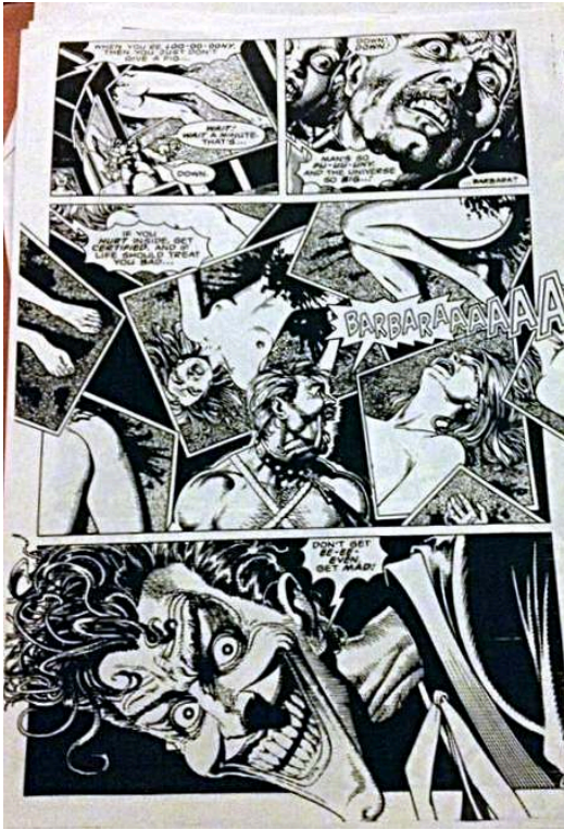
Picture 6. Original inked artwork for page 26, before editing (see picture 5).