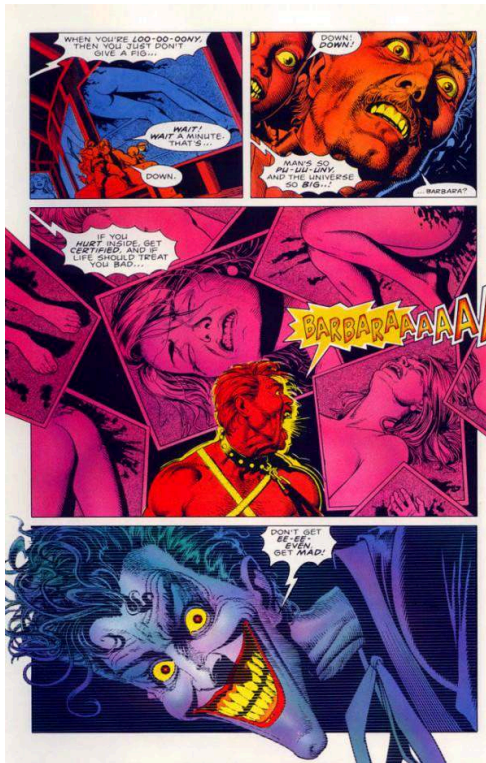
Picture 5. Page 26 of the original version, as edited, to compare with picture 6. BOLLAND, Brian (art), MOORE, Alan (story), HIGGINS, John (color). Batman: The Killing Joke . New York : DC Comics, 1988. ISBN 978-0-930289-45-4 (as reprinted in Absolute Batman: The Killing Joke . Burbank, CA : DC Comics, 2018, p.90).