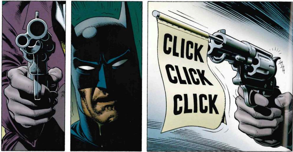
Picture 2. BOLLAND, Brian (art and color) et MOORE, Alan (story). Batman: The Killing Joke - The Deluxe Edition . New York : DC Comics, 2008. ISBN 978-1-4012-1667-2 (as reprinted in Absolute Batman: The Killing Joke . Burbank, CA : DC Comics, 2018, p.50).