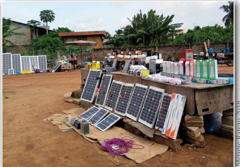
Figure 3 Informal sellers of solar equipment under the Godomey interchange in Cotonou

2018). However, these payment facilities do not target the poorest. A sales manager for a brand of solar kits explained to us that the amount required for the first payment was deliberately high in order to exclude customers who could not keep up with their payments (interview, Cotonou, 28 July 2018).