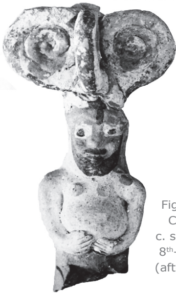
Fig. 12: Amman, Tomb C: terracotta figurine, c. second quarter of the 8 th -mid-7 th century BCE (after HOMÈS-FREDERICQ 1987, fig. 4).

Notwithstanding the chronological and cultural distance between these examples and the mask from Carthage [61], they show that a combination of female and male elements could have been used in antiquity to represent the dual personality of a goddess or the association between a male and a female deity. One may wonder if the same interpretation can be assumed for the mask from Carthage, although it remains so far an isolated example in Phoenician and Punic-speaking areas.