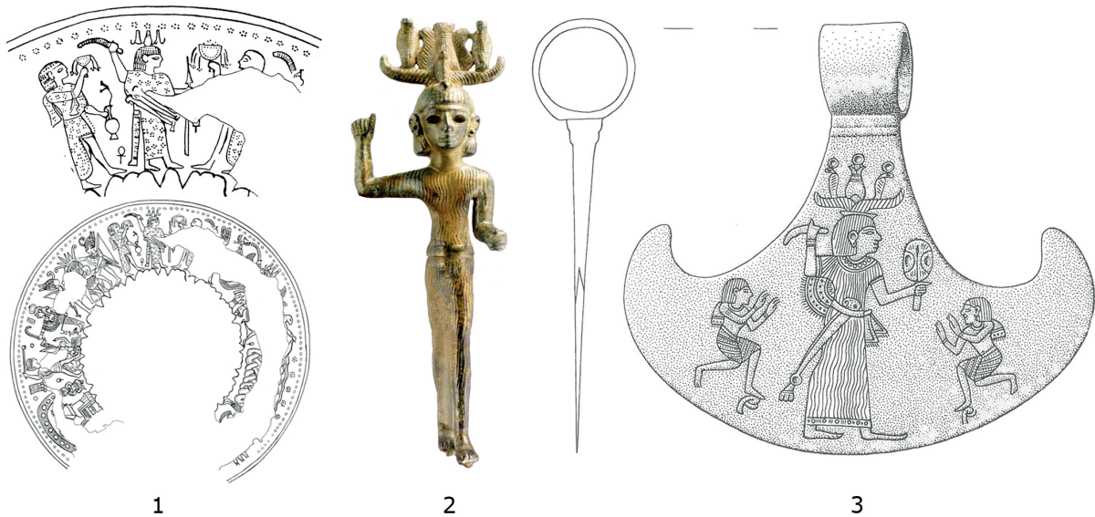
Fig. 2: 1. Nimrud: "Pantheon bowl", c. 8 th century BCE (after BARNETT 1935, fig. 7); 2. Qala'at Faqra: bronze statuette, c. 9 th century BCE (after FONTAN & LE MEAUX 2007, p. 334, n. 135); 3. Bronze axe-head, c. 8 th century BCE? (after SEEDEN 1980, pl. 131, 11).

mentioning the Baalat Gubal [27], the stele of Melqart from Bureij [28], and the bronze enthroned statuette of Astarte from the sanctuary of El Carambolo [29] (fig. 3).