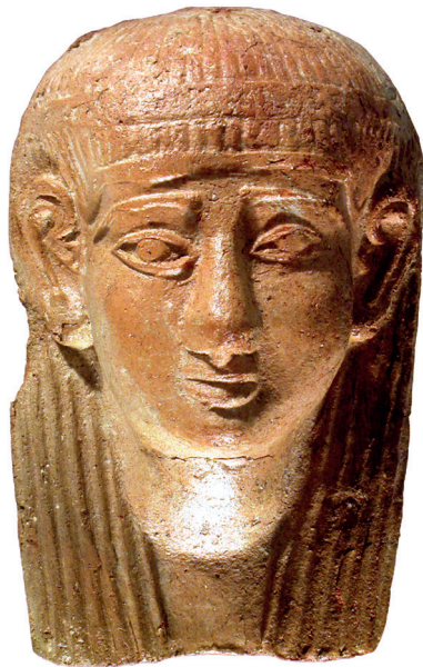
Fig. 9: Tharros: clay protome, c. 6 th century BCE (after FONTAN & LE MEAUX 2007, p. 363, n. 251).

Hellenistic period. Accordingly, it apparently prevents a clear association with a specific deity. How can this change be explained? A possible interpretation can be provided by looking at the archaeological framework of the female group, which seems to have been elaborated in the Levant around the late 9 th -early 8 th century BCE [47]. This period of time corresponds to the phase when Phoenician speaking groups mainly coming from the central Levant moved westwards and established themselves in enclaves within city harbours or founded new settlements in the western Mediterranean. Although it is not certain whether the development of this iconography was a deliberate strategy, such representations set out a “middle ground” [48] between Phoenicians and non-Phoenician speaking groups, which may have recognized something familiar in those images in a time characterized by cultural encounters and when sacred areas represented the most suitable spaces for these meetings. Evidence supporting this hypothesis can be recognized in the distribution of such iconographies also in non-Phoenician areas already in the eastern Mediterranean. Four calcareous double-faced female heads from the Amman Citadel [49] testify to its presence in Transjordan, where inscriptions suggesting the presence of Astarte in this region are also