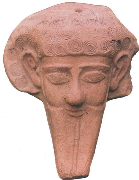
Fig. 8: Utica, tomb 42: clay protome, c. 6 th century BCE (after FONTAN & LE MEAUX 2007, p. 360, n. 239).

The choice of limiting the portrait of a deity to a face is noteworthy, because it reduces the possibility of including elements peculiar to a specific divine figure. This absence of features stands out in contrast to the previous way of representing deities with their insignia, which remained in use and was resumed during the