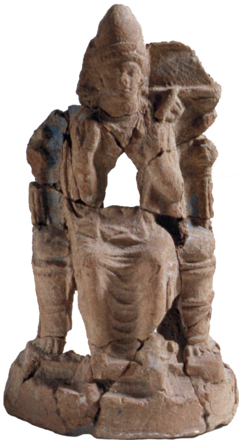
Fig. 10: Carthage, Byrsa: enthroned deity, c. 3 rd -2 nd century BCE (after PETERS 2004, p. 237, n. 19).