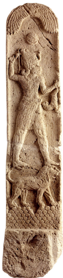
Fig. 4: Nahr el-Abrash?: stele of Shadrapa, c. 6 th century BCE (after FONTAN & LE MEAUX 2007, p. 52, n. 76).