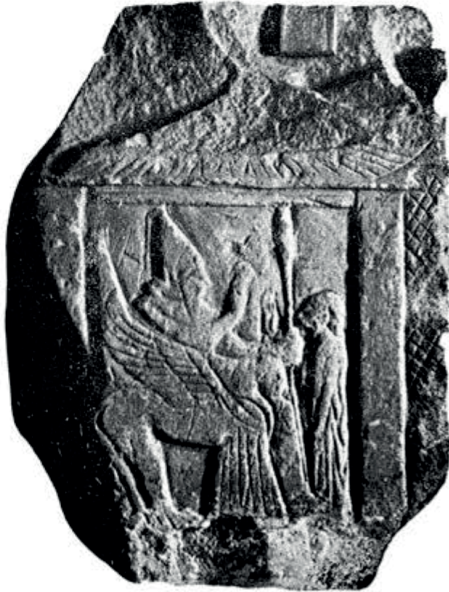
Fig. 7: Sousse, Tophet: stele, c. 5 th century BCE (after PICARD 1954, pl. CXXVI, Cb 1075).

Although other hypotheses have been suggested [42], this god is usually recognized in an anepigraphic stele from the Tophet of Sousse (fig. 7), which shows a bearded character wearing a high conical headdress, holding a wand/sceptre and sitting on a throne with winged sphinxes [43]. Did this god have various faces, or did this variety of iconography depend on regional or chronological differences? For the time being, these questions remain unsolved.