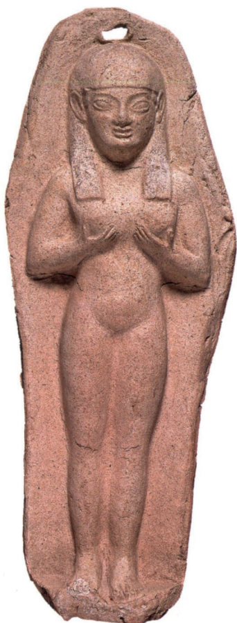
Fig. 1: Tharros, necropolis: clay figurine of a nude female, c. 6 th century BCE (after PETERS 2004, p. 181, n. 115).

The first issue is the distinction between human and divine characters. In the literature, there are many cases where scholars suggested different readings of the same type of figures. The best-known example is probably that of the clay figurines of naked women ( fig. 1 ). Although often described as “Astarte figurines”, they have been connected to a variety of goddesses and also considered as images of priestesses or worshippers [19].