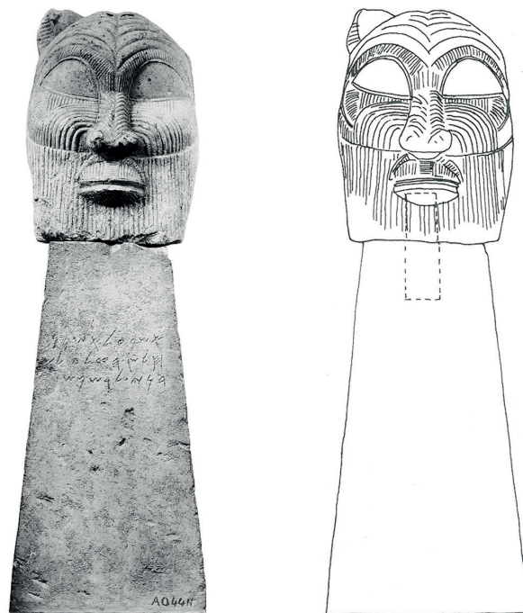
Fig. 6: Palaikastro: limestone cippus with Phoenician inscription and Bes-like bearded head, c. 650 BCE (after HERMARY 1989, p. 295).

Not all the deities epigraphically attested [40] appear to have a specific iconography. A case study in this regard is the god Baal Hammon, the main deity of the so-called Tophet sanctuaries [41]. Notwithstanding the numerous inscriptions found in this type of sacred areas, there is not yet any evidence proving a clear connection between an inscription and the god's image.