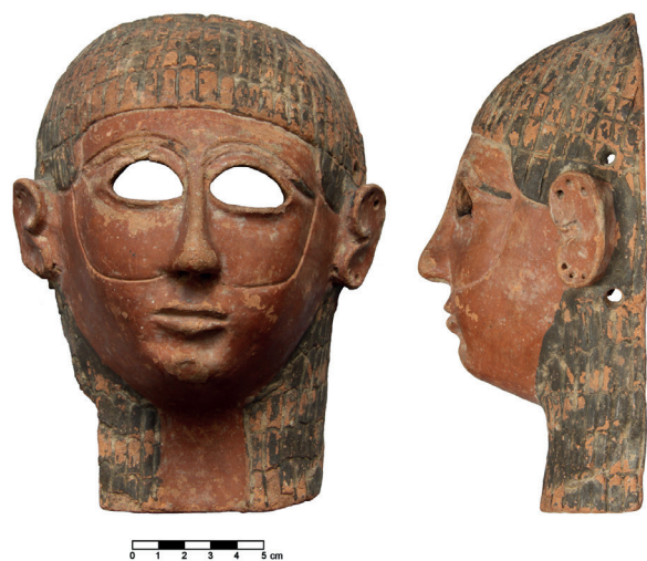
Fig. 11: Carthage, necropolis?: female mask, c. mid-7 th –early 6 th century BCE.

There follows a gap until the Neo-Assyrian period, when a few hymns refer to a bearded Ishtar or describe the same goddess as both female and male. A controversial image of a bearded deity in a seal impression from Nimrud also dates to this period. During the 1 st millennium BCE, various iconographies of bearded female figures are known in other areas of the eastern Mediterranean, such as a fragmentary clay figurine of a pregnant woman with black painted moustaches and beard, from a tomb of Amman ( fig. 12 ) recalling the Phoenician type of the so-called dea gravida , and a group of dual-gendered figurines from the sanctuary of Ayia Irini in Cyprus [60].