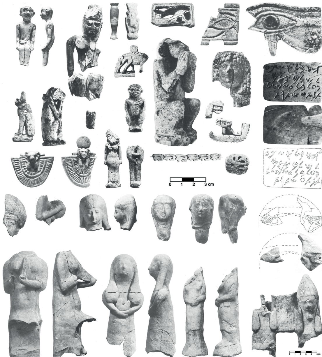
Fig. 13: Sarepta, Shrine 1: a selection of the finds, c. 8 th -7 th centuries BCE (after PRITCHARD 1975, fig. 41-43).

While it remains undetermined in aniconic images and symbols representing the divine presence (e.g., standing stones, stelae), gender cannot always be clearly recognized in divine figures. It is not clear, however, whether modern scholars are simply not able to identify gender parameters, or if the latter were intentionally not specified for some reason. In other words, does this gender ambiguity in Phoenician and Punic divine iconography reflect our inability or a specific intention of the Phoenicians? For the time being, this question remains open, but it emerges that some attributes that have been traditionally assumed as gender parameters (e.g., breasts, beard, axe) should be reconsidered. The combination of male and female elements in the same image, as suggested for the mask from Carthage,