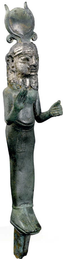
Fig. 5: Syria: bronze statuette of a goddess, c. 8 th century BCE (after FONTAN & LE MEAUX 2007, p. 158, n. 132).

a temple could have hosted the cult of various deities, however, the association between inscription and iconography cannot be considered unambiguous in these cases.