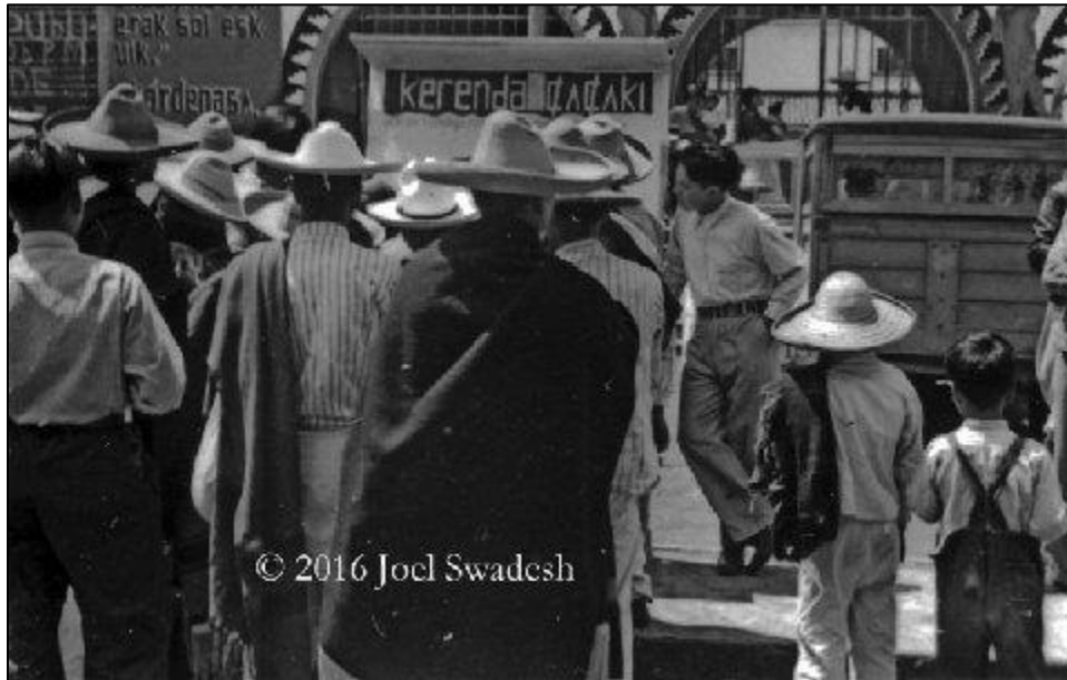
Figure 2: Example of Tarascan Project teaching material: a mural newspaper bearing the title kerenda çiçaki ‘crag flower’. A younger man, probably a teacher, stands by as members of the community read local and national news.

learned to read and write in 30 to 45 days (Barrera-Vásquez, 1953: 83). The project ended abruptly in 1941 due to the withdrawal of all funding.