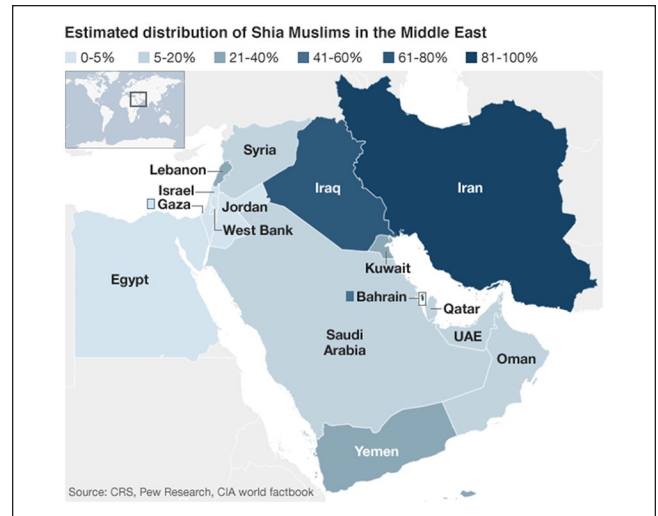
Figure 2. Estimated Shia Muslims in the Middle East (Poole, 2016).

Sectarianism has certainly informed the foreign policy priorities of Iran and Saudi Arabia . . . But this isn’t simply, or even primarily, a religious struggle. It’s a political and economic one,