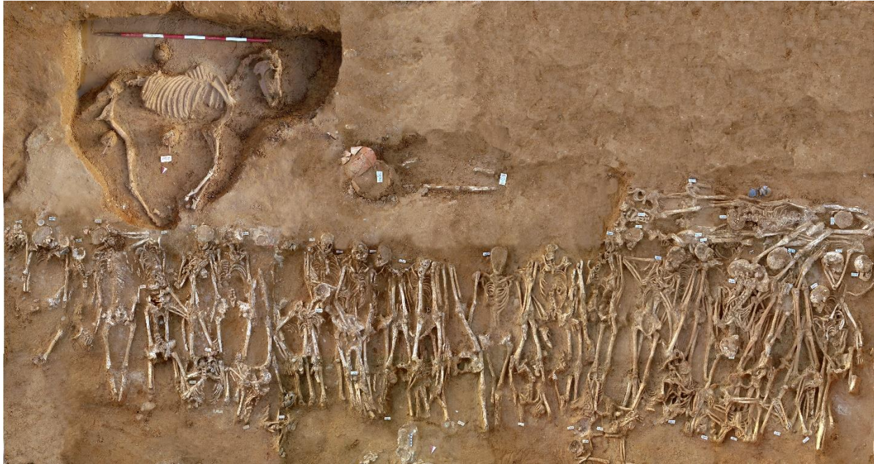
Figure 1. Mass burial from the battle of 409 BC, Himera, Sicily.