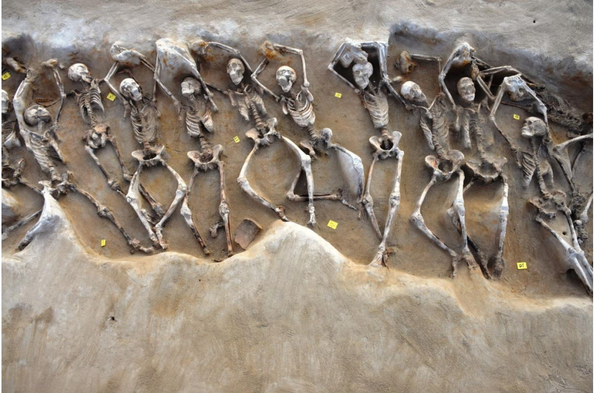
Figure 2. The first mass burial of the 2016 excavation in Phaleron Necropolis, showing men with their hands attached with iron bonds