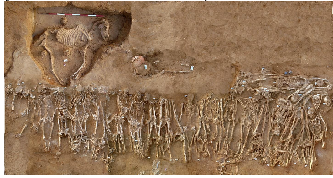
Figure 1. Mass burial from the battle of 409 BC, Himera, Sicily.