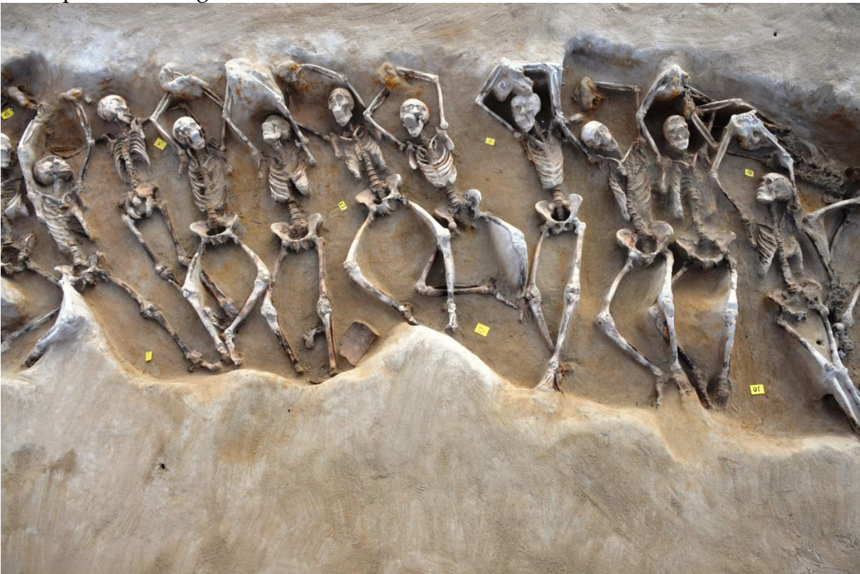
Figure 2. The first mass burial of the 2016 excavation in Phaleron Necropolis, showing men with their hands attached with iron bonds