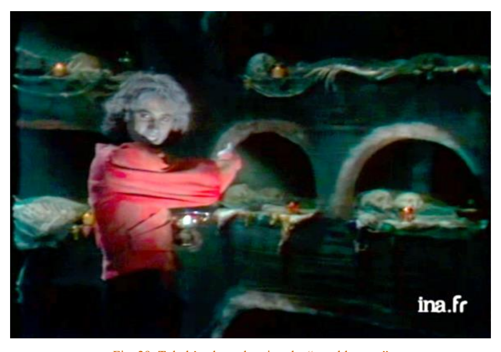
Fig. 29. Tybalt's ghost showing the "mouldy ones"

Then he drinks before addressing Juliet again: "Tu vois cette poussière? Ce sont les os de tes ancêtres ensevelis depuis des centaines d'années. Leurs esprits te frôlent, te touchent. Comme elles sont loin les mains tièdes de Roméo sur ton corps. Bois! Bois!" ["Do you see that dust? Here are