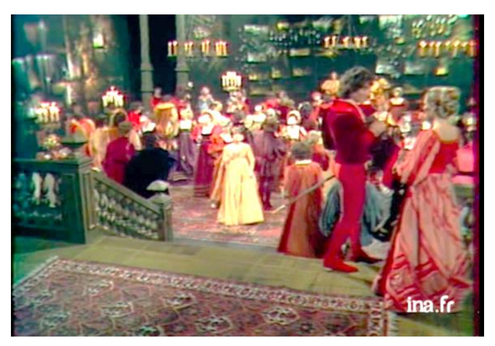
Fig. 13. The ball sequence, before Romeo sees Juliet

9 Colour is again used to suggest the burning vividness of youth in the ball sequence (Fig. 13-16).