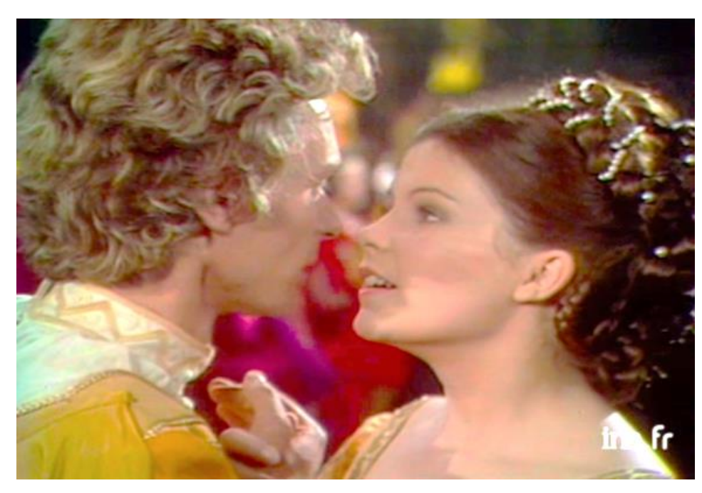
Fig. 16. No sooner meeting than kissing

The marketplace sequence with the nurse (Fig. 17) as well as the central tragic combat (Fig. 18) again cultivate the use of vivid colours to suggest the burning life of youth.