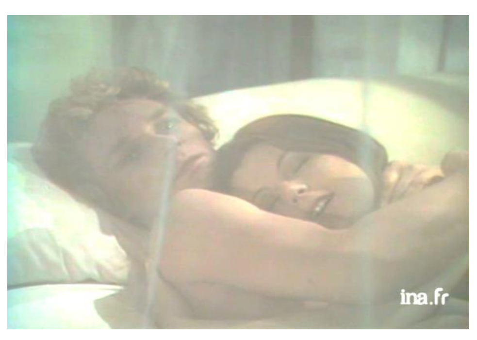
Fig. 23. Romeo and Juliet in bed in close-up

The farewell scene is also put under the sign of bodily display as Juliet leaves her bed naked, to try and keep Romeo a little longer. It is the nurse who prudishly covers her body a few seconds later (Fig. 24-25).