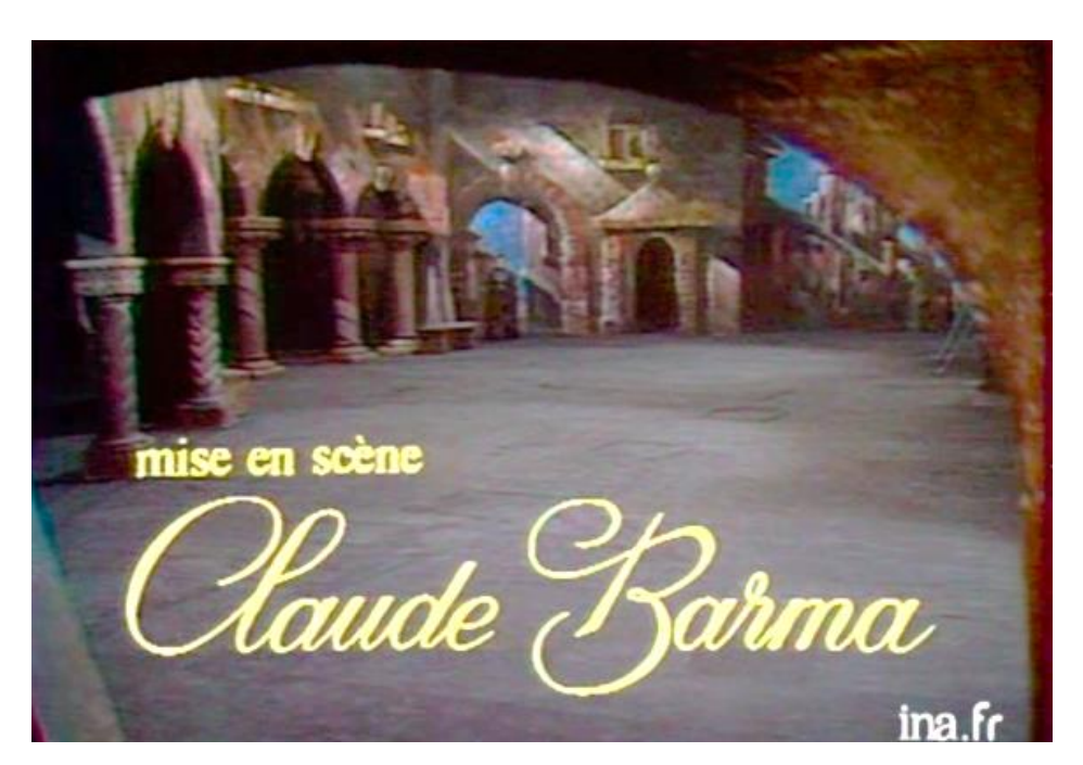
Fig. 2 The main décor of Claude Barma's TV film

Juliet by first briefly exploring its Zeffirellian aspects, by then showing how it combines contrary features that make it both a burning and freezing adaptation of Shakespeare's play which echoed a woeful real-life story that had taken place in France in 1969 which was still in Claude Barma's mind in 1973.