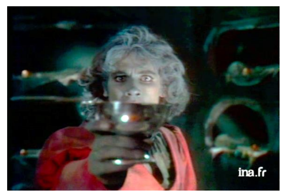
Fig. 27. Tybalt attracting his cousin into his horrible vault

The sequence is clearly evocative of the horror film aesthetics that should give the spectators goose pumps. The words uttered by Tybalt's ghost translate the horrible visions described by Juliet in IV.3: