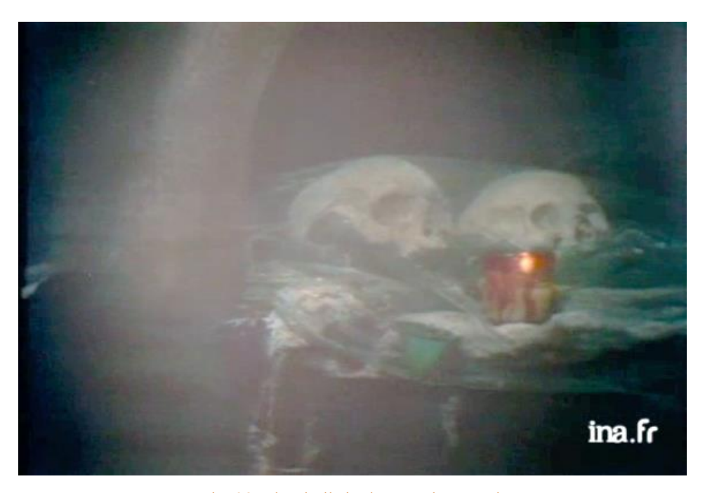
Fig. 28. The skulls in the Capulets' vault

of the words he had uttered in IV.1: "Poison, gel, sommeil éternel, froide, seule, seule. Abandonnée dans l'ancien caveau où reposent les Capulet, seule, seule." ["poison, frost, eternal sleep, cold, alone, alone. Abandoned in the ancient vault where the Capulets rest. Alone, alone"]. This is followed by a devilish laughter and Tybalt appears on screen, holding a cup and addressing Juliet (Fig. 28-30): "Seule, Juliette? Non. Non, je suis là, moi. Et les autres aussi. Les moisis, les pourris, les desséchés, les gluants. Tu sens comme nous puons? Bois, bois" ["Alone, Juliet? No, you're not, I am here with you. And all the others too. The mouldy, the rotten, the dried ones, the slimy ones"].