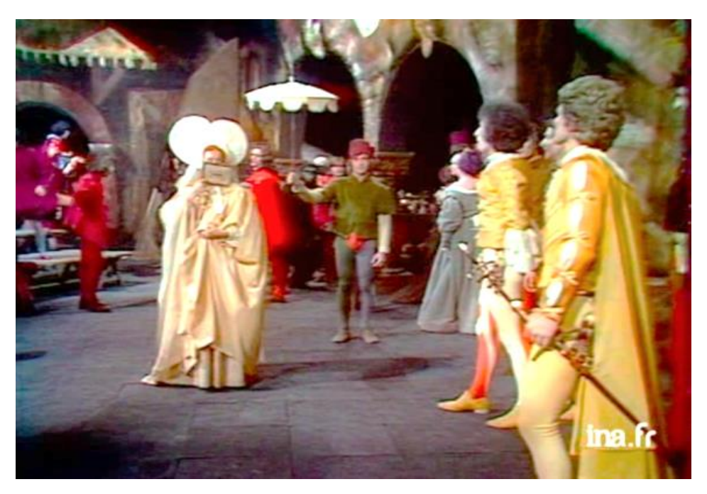
Fig. 17. Playing with the nurse in the marketplace

The marketplace sequence with the nurse (Fig. 17) as well as the central tragic combat (Fig. 18) again cultivate the use of vivid colours to suggest the burning life of youth.