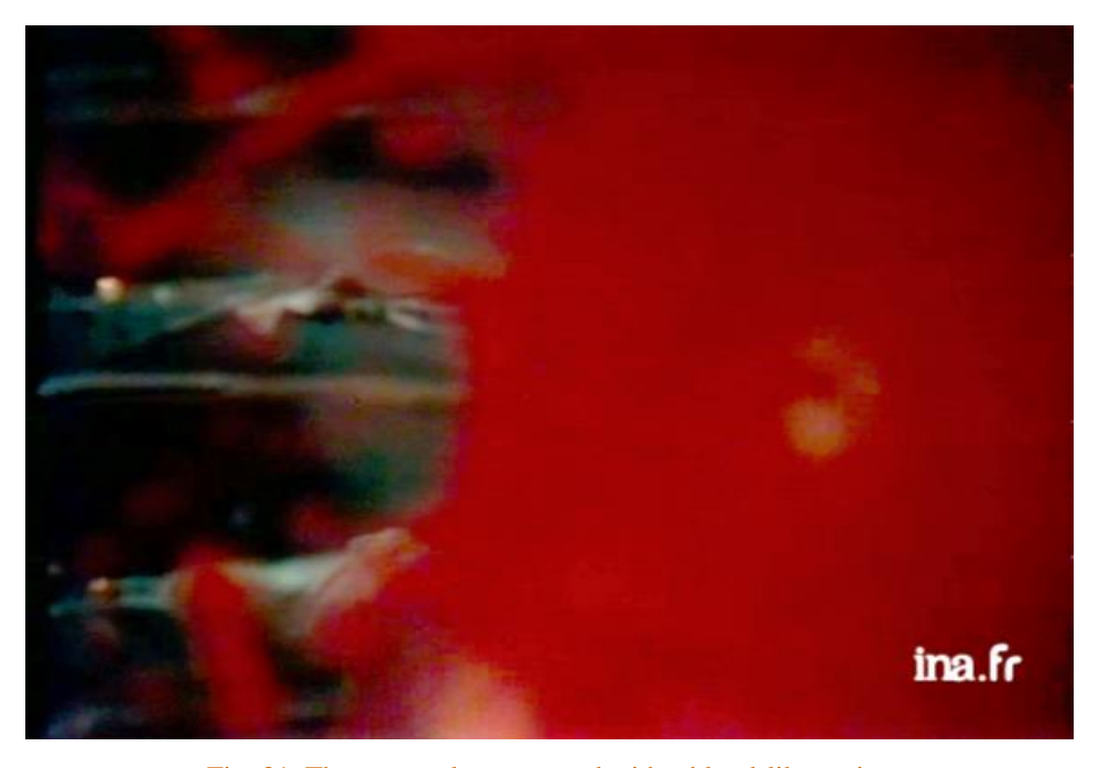
Fig. 31. The camera lens smeared with a blood-like potion

Then Tybalt throws the blood-like liquid on the lens of the camera (Fig. 31), giving the whole sequence a nightmarish atmosphere that is evocative of the tradition of Dracula films.