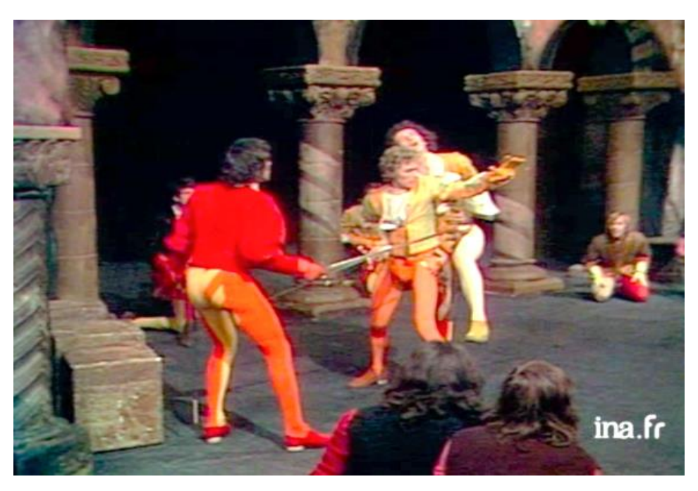
Fig. 18. Mercutio is killed under Romeo's arm

After Tybalt's death, the colours get darker to emphasize the gloomy side of the story that the spectators had already been made aware of from the start in several ways.