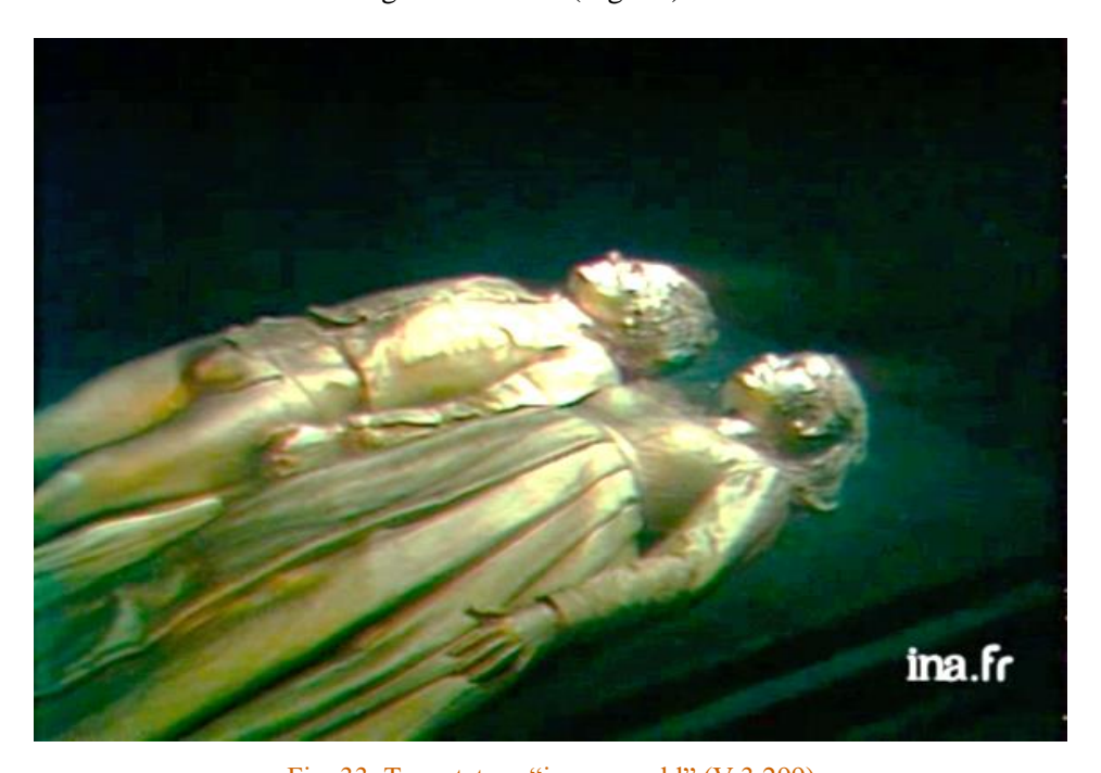
Fig. 33. Two statues "in pure gold" (V.3.299)

The tension between burning and freezing is epitomized in the last images of the film, which show Romeo and Juliet turned into golden statues (Fig. 33).