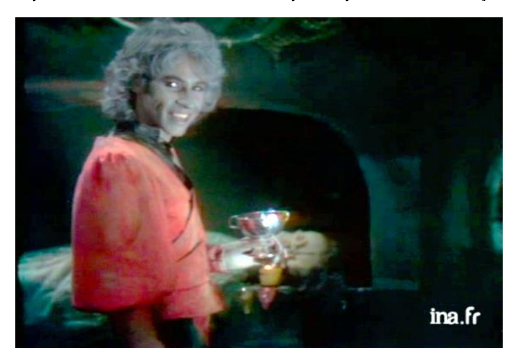
Fig. 30. Tybalt's sarcastic smile

your ancestors' bones that have been buried for hundreds of years. Their spirits are close to you; they touch you. How far are Romeo's warm hands on your body now! Drink! Drink!"].