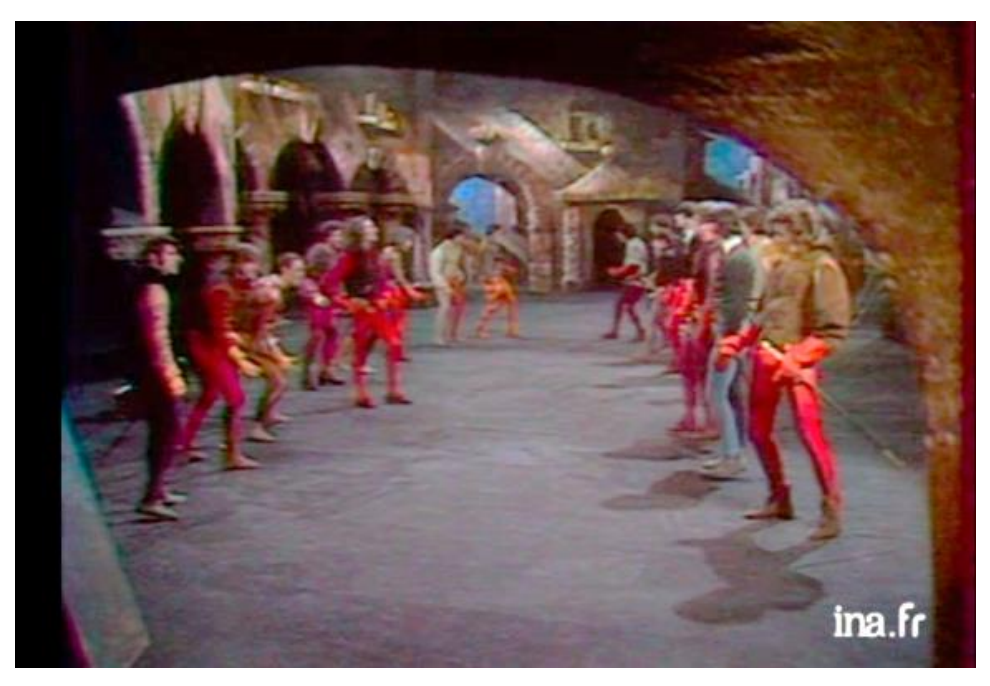
Fig. 4. The "thumb-biting" scene: the mirror effect between the two camps