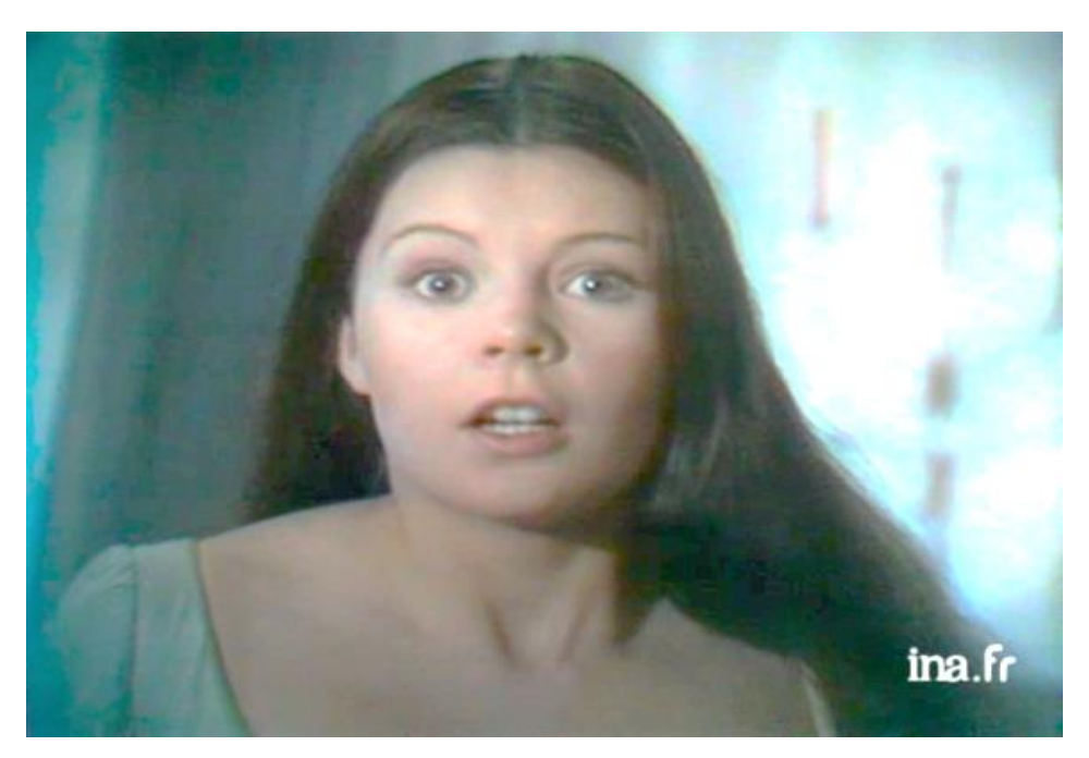
Fig. 26. Juliet's terror when she sees the ghost of Tybalt

The bed is later thrown into relief in the sequence staging Juliet's mock suicide. The decaying body that is at the heart of Juliet's fears, is visually emphasized when her monologue is replaced by an interpolated ghost sequence. Before she drinks the Friar's potion, Juliet fearfully sees the ghost of her cousin Tybalt (Fig. 26), attracting her into the vault he's now inhabiting.