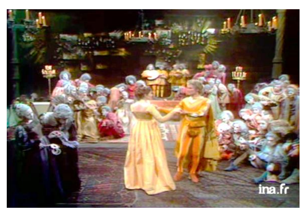
Fig. 20. Romeo and Juliet dancing among the vampires

The film uses this kind of theatrical freeze frame on several occasions later, to create a chilling atmosphere, served by a clever use of Georges Delerue's music, at the heart of a warm and lively sequence. Barma uses the same device in the ball sequence first to freeze the whole ball, including Juliet, when Romeo arrives, and then when all the characters appear at a standstill sitting around Romeo and Juliet who are thus the only living and dancing couple left in the ball. The couple is surrounded by these ghostly figures who seem to announce their death (Fig. 20).