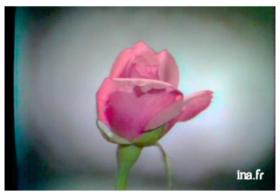
Fig. 6. The first image that is related to Romeo

Then the spectators discover him talking with Benvolio, languidly lying among golden sheets surrounded by candles, another intimation of mortality, in an image that looks like a vanity (Fig. 7). The sequence is suggestive of a potential homo-erotic relationship between the two men.