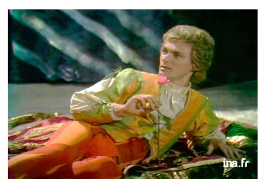
Fig. 8. Romeo as Rosalind's lover