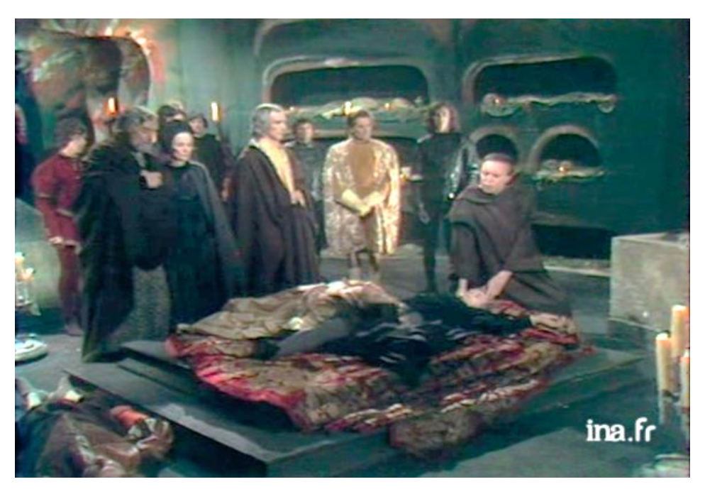
Fig. 34. Last living tableau

This image of a society causing and then watching a catastrophe had a specific topical resonance in 1973.