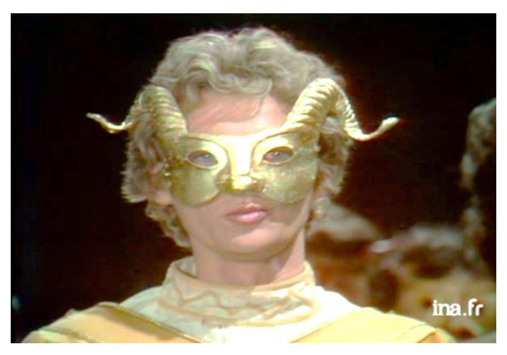
Fig. 15. Romeo seeing Juliet

Romeo and Juliet are associated to become a couple of birds wearing the same feathers through the use of costume.