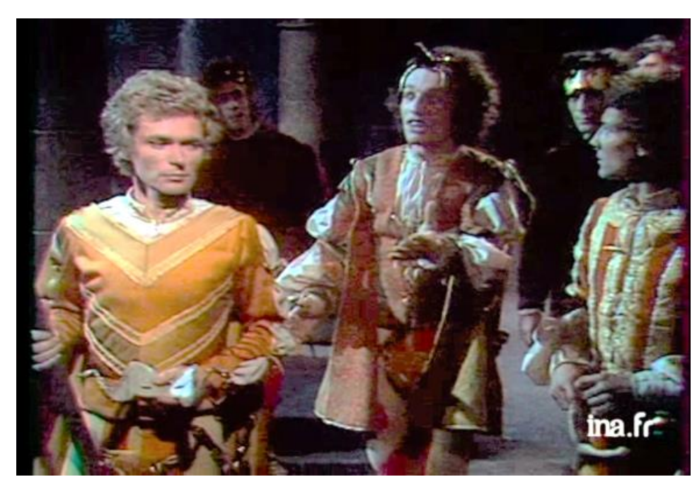
Fig. 19. Romeo's immobility during Mercutio's Queen Mab speech

The film uses this kind of theatrical freeze frame on several occasions later, to create a chilling atmosphere, served by a clever use of Georges Delerue's music, at the heart of a warm and lively sequence. Barma uses the same device in the ball sequence first to freeze the whole ball, including Juliet, when Romeo arrives, and then when all the characters appear at a standstill sitting around Romeo and Juliet who are thus the only living and dancing couple left in the ball. The couple is surrounded by these ghostly figures who seem to announce their death (Fig. 20).