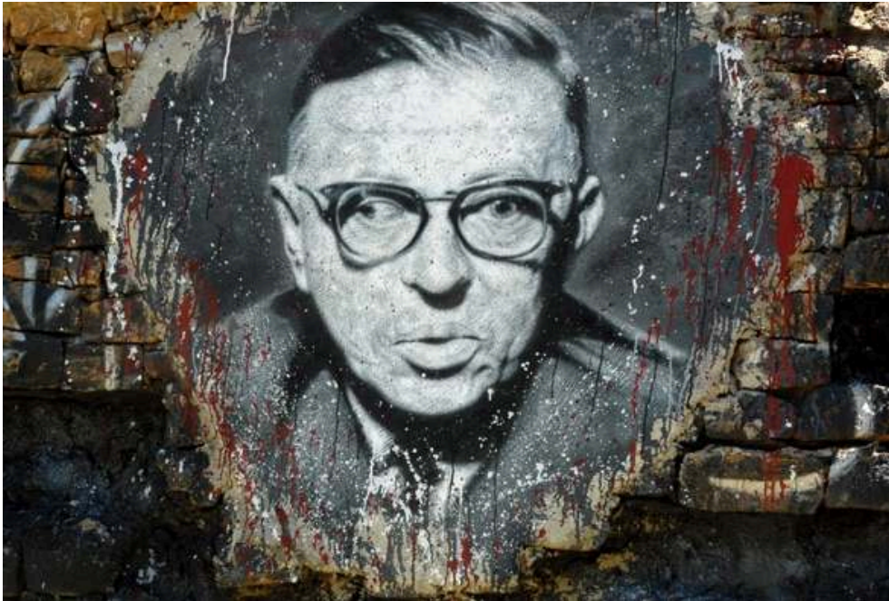
Fig. 2. Jean-Paul Sartre

Thierry Ehrmann, « Jean-Paul Sartre », La Demeure du Chaos, musée d'art contemporain, Saint-Romain-au-Mont-d'Or