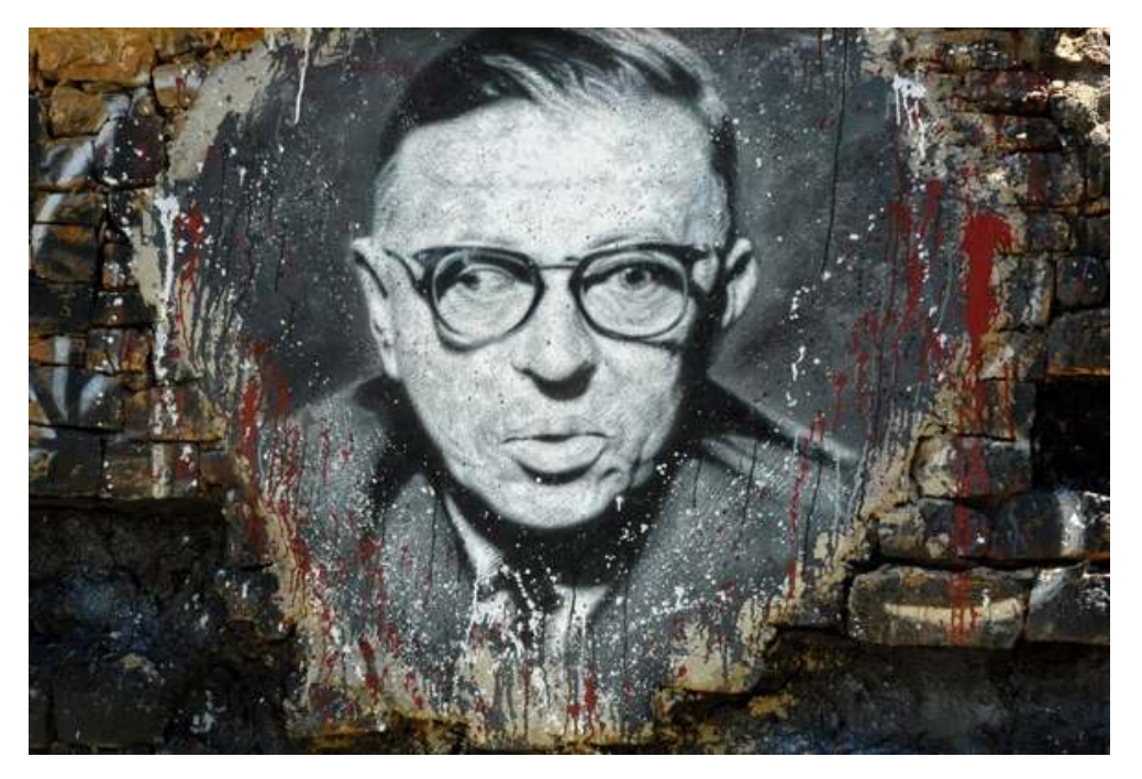
Fig. 2. Jean-Paul Sartre

Thierry Ehrmann, « Jean-Paul Sartre », La Demeure du Chaos, musée d'art contemporain, Saint-Romain-au-Mont-d'Or