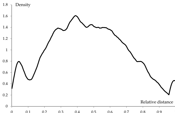
Figure 1: Probability distribution function of the relative distance for new constructions

Notes: French urban areas, all years of data used. 218,767 observations. For each new construction, we compute the distance between the centroid of its municipality and the centroid of its urban area and divide by the greatest observed distance for any new construction in this urban area. Less than 2% of the observations are beyond 95% of the maximum distance to the centre. The modal distance is at about 40% of the maximum distance to the centre of the urban area.