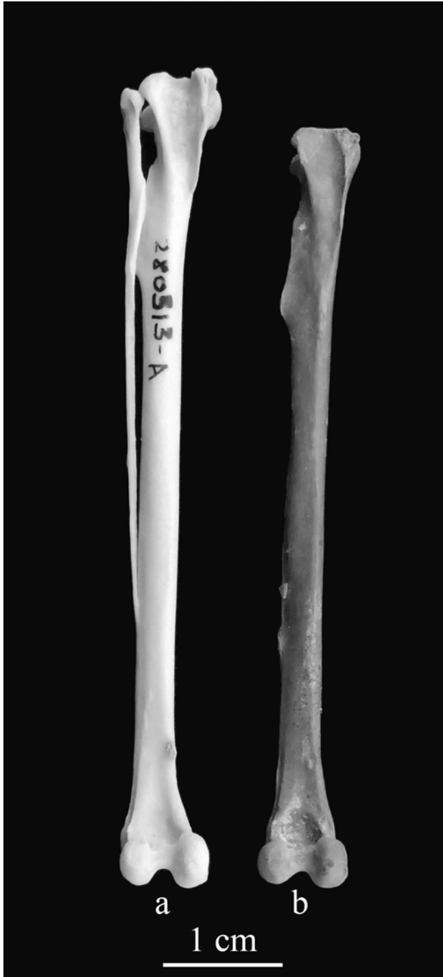
Figure 2. Right tibiotarsi of Athene cunicularia in cranial view: (a) reference collection (MEC 280313-A) and (b) Grotte Cadet 2 (GC2-2018-U4).

Three proximal carpometacarpi from Abri Cadet 3 have oblique processus extensorius with a rounded end and a narrow spatium intermetacarpale (Kessler 2017). The damaged processus pisiformis is in line with the mid-shaft of the major metacarpal (Olson and Hilgartner 1982). The facies articularis digitalis minor and the sulcus tendinosus of the specimen from Grotte Blanchard are similar to those observed on modern specimens.