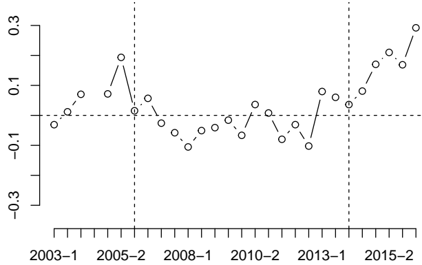
Figure 2: Relative Nash spread

Figure 2 depicts how the difference \Delta_t^{\text{outside}} - \Delta_t^{\text{inside}} in (restricted) routes outside the Wright zone and (unrestricted) routes inside the Wright zone evolves over time. The difference is therefore positive when the gap between the actual and Nash quantities is greater in restricted routes. Before the full repeal, the difference remains close to 0, except between the start of public relations campaign by Southwest in 2004 and the implementation of the partial repeal in 2006. Indeed Figure 1 has shown that, at the moment of the partial repeal implementation, the Nash spread goes back to 0 more slowly in restricted routes. After the full repeal in 2014, as the relevant market from Dallas expands with new services offered from Love Field and Southwest starts scheduling flights from Fort Worth, the difference between the Nash spread in previously restricted routes increases compared to the spread in non restricted routes (linking Dallas to city markets within Texas and its neighboring states).