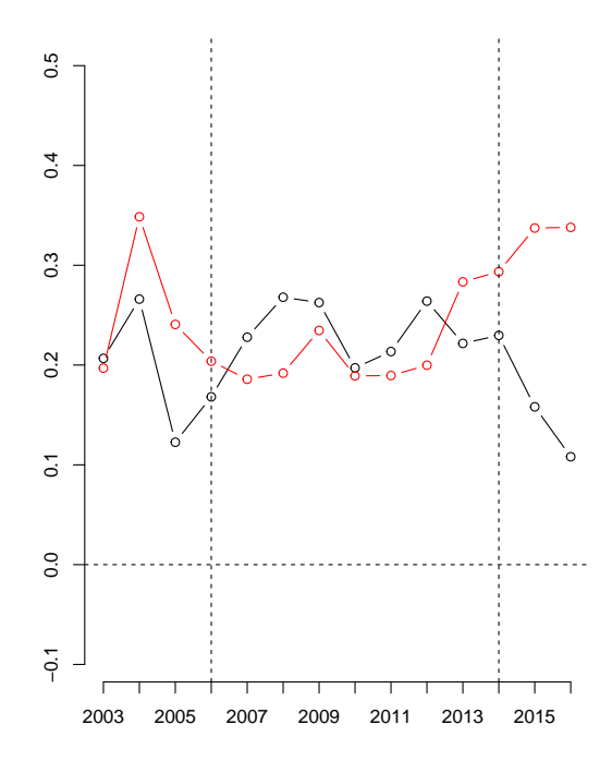
Figure 1: Nash departures in restricted and unrestricted routes

evolves over time for routes s restricted by the Wright amendment (in red) and for routes s unrestricted (in black). Here n stands for the numbers of quarter \times airlines observations in the group of routes under scrutiny, either restricted or not. The two vertical dotted lines indicate the moment of partial and full repeal.