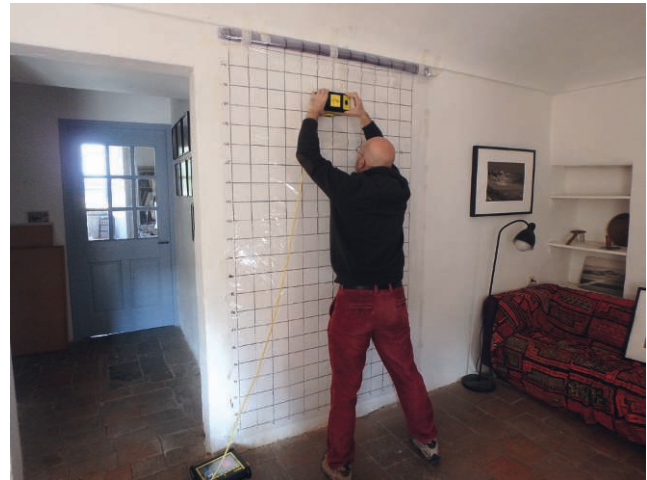
Figure 2. GPR survey with the pulseEKKO TR1000 on a 5 cm mesh grid.

These initial tests provided interesting information on the structure of the walls at different depths. The most superficial maps, around 5 cm depth, allow the characteristics of the exterior facing to be recognized: masonry seals are relatively clearly visible and make it possible to identify the size of the blocks and therefore the differences in the type of brickwork used. The blockages that affected the last condition of the wall before it was plastered are also easily identifiable.