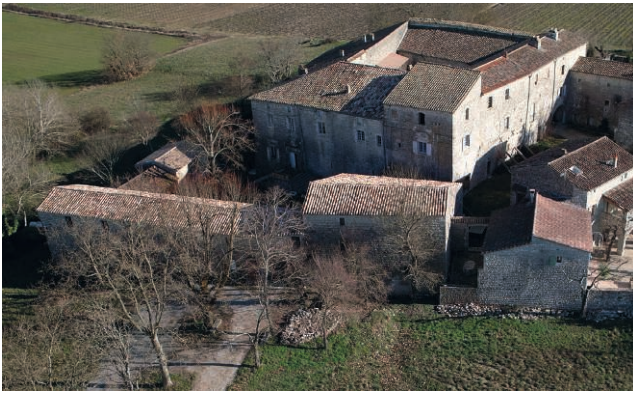
Figure 1. The main building of the commandery of Jalès.

(center frequency of 1 GHz) which allows an investigation depth of around 1 m. In order to position the measurements and achieve the most regular survey grid possible, an actual grid was drawn on a flexible plastic support. This transparent support was placed on the walls during the survey (Fig. 2). The horizontality of the measurement grid is ensured by a simple spirit level. This grid makes it possible to produce measurement profiles every 5 cm. To ensure the finest sampling possible, each zone was surveyed in both horizontal and vertical directions.