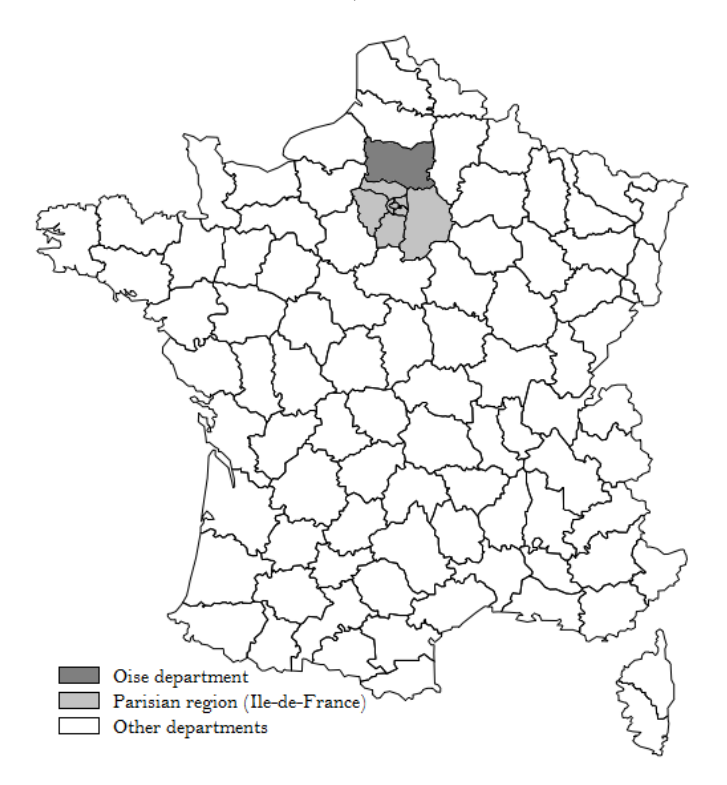
Figure 2: French Departments

We dispose Perval data on individual transactions for Oise department. The dynamics of Oise real estate market has been influenced by several factors. First of all, Oise is bordering on Parisian region, Ile-de-France (see Figure 2), and different kinds of transport connections between with Paris are available. Hence, the train ride between Paris and some cities of the Southern part of Oise department takes less than 30 minutes, which makes these cities potentially attractive. This attractiveness was strengthened by the extent of house price growth in Parisian region. In fact, between 2000 and 2006, apartment prices in Parisian region increased by 112%, house prices - by 96%. This growth has been all the more significant in two departments which are bordering on Oise : Val d'Oise (+126% for the apartments and +99% for the houses) and Seine-et-Marne (+121% and +99% respectively).