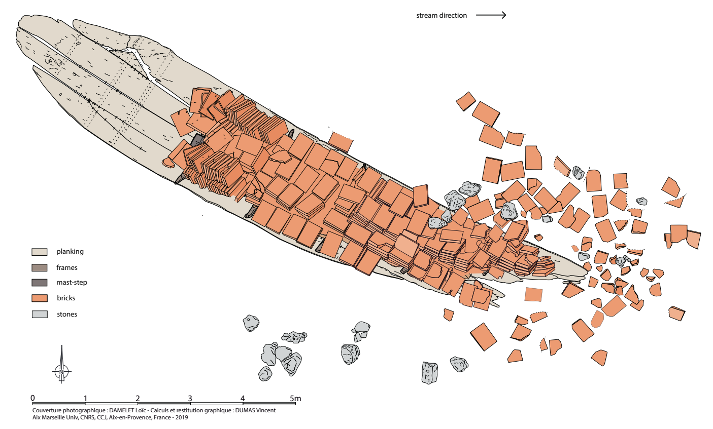
Fig. 2: The shipwreck with its cargo of bricks.

The bricks, stacked in columns and arranged in rows, were settled on a support made out of branches and small tree trunks arranged longitudinally on top of the frames. This dunnage, used for preventing any damage both to the hull and the cargo, might have been sold or used as firewood after the unloading of the brick cargo (fig. 3).