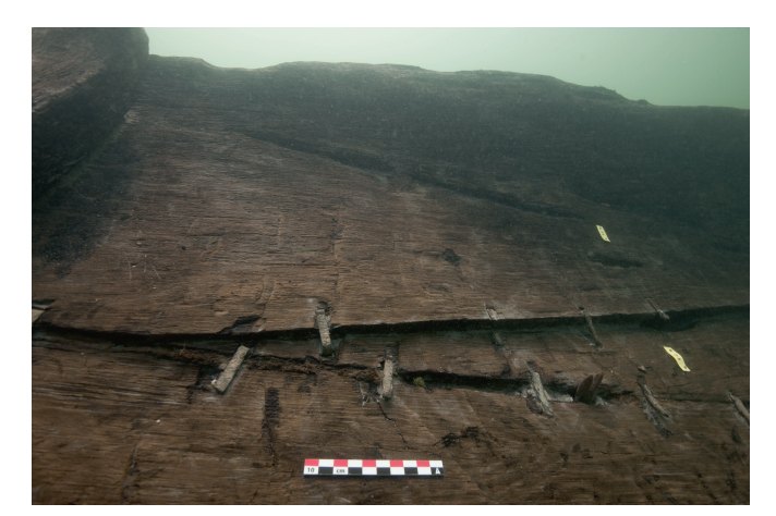
Fig. 5: View of the bottom of the barge with the clamps connecting the planks.

mast step housed a towing mast used for hauling the barge upstream, a typical riverine system of propulsion attested in both Roman iconography and archaeological sources (Arnold 1992, p. 57, 84-85; de Izarra 1993, p. 123; Rieth 1998, p. 106-109; Marlier, Poveda 2014, p. 209-211). It is interesting to note that on the Kupa River the practice of towing vessels upstream by manpower, using prisoners or poor peasants named burlaci , survived until the 20<sup>th</sup> century although haulers were gradually replaced by animals from the second half of the 19<sup>th</sup> century onwards (Ott 2008, p. 68).