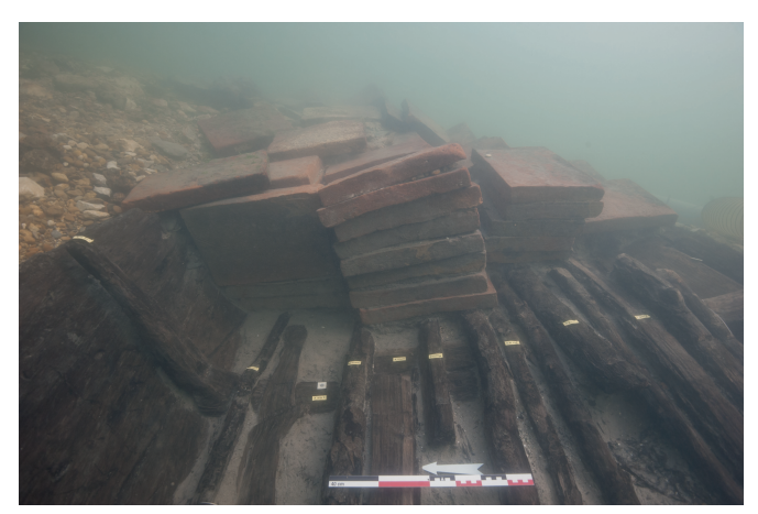
Fig. 3: View of the brick cargo lying on the dunnage. The northern side of the barge is preserved almost to its original height.

The Kamensko river barge is a flat-bottomed vessel of a bottom-based construction (Hocker 2004; Pomey, Rieth 2005, p. 33, 195-198).