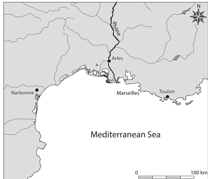
Fig. 1: Location of the case studies in southern France (map G. Boetto).

Lastly, there is some analogy between timber supply in the Mediterranean area and ships, in the sense that both are mobile. Timber has been imported, generally by floating on rivers, for centuries into the Mediterranean area because of the early