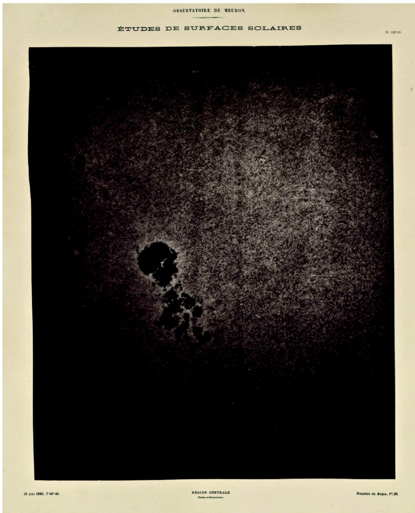
Figure 1. “Atlas de photographies solaires” by Jules Janssen, 1903, planche XXVII.

Aside from the periodicals edited by the Observatoire, digitised by the BnF and accessible on Gallica, the Observatoire's digitised documents cannot be accessed online yet. The team working for the library does not have enough staff to carry out digitisation projects and to develop a digital library project at the same time. In 2014, the first analysis of the existing software was underway, as well as a reflection on what a digital library on the history of astronomy should be, including needs and editing policies. In 2015, priority will go to the development of a tool allowing the open accessibility of digitised content on the Internet. At this stage, we can say that beyond file management and access features, the tool will need to be an OAI harvester and allow boosting of its editorial content.