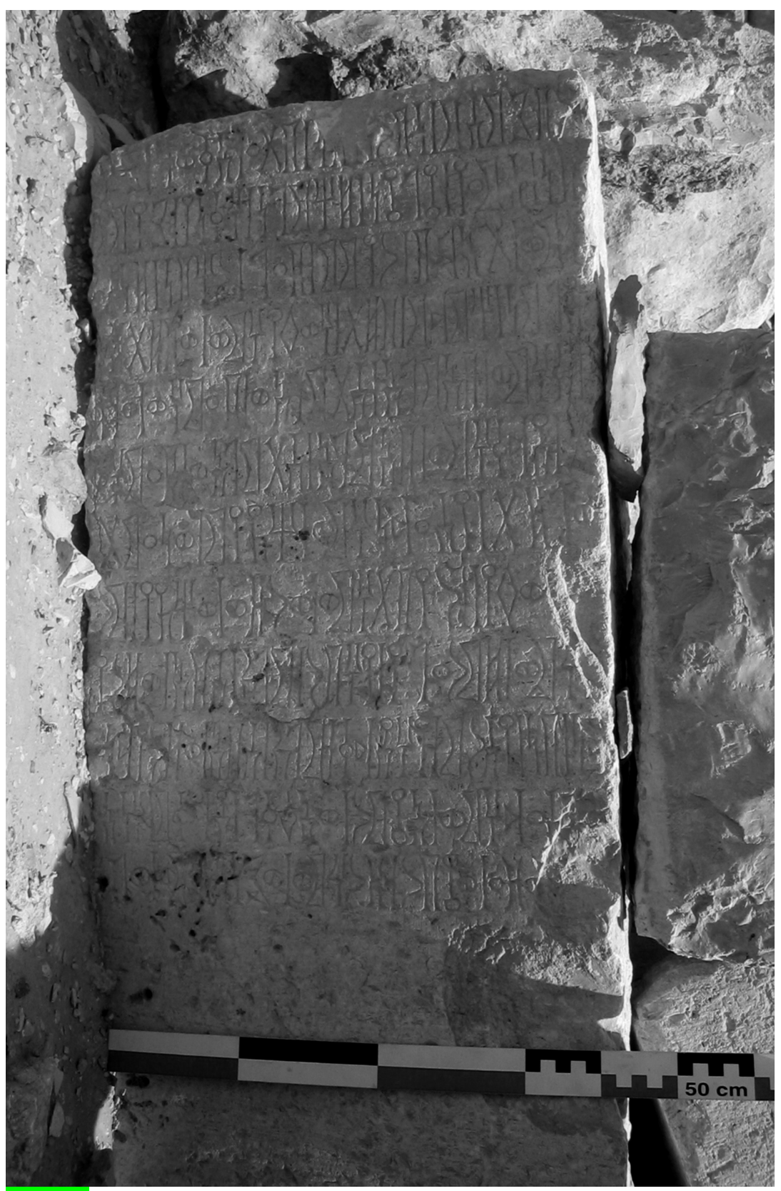
Figure 2: Inscription Jabal Riyām 2006-19 (J. Schiettecatte).