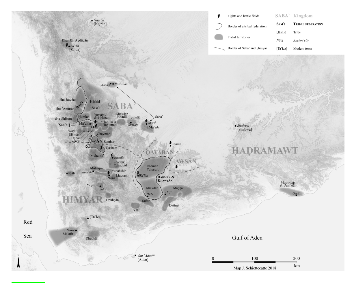
Figure 1: Tribal and political map of South Arabia in the second century CE (J. Schiettecatte).

Contrasting with this relatively peaceful century, the second century CE was a period of epidemics and endless conflicts between all the South Arabian political entities: the kingdoms of Saba', Himyar, Qatabān, Awsān, and Hadramawt, and the principalities of Madhā and Radmān-and-Khawlān (Fig. 1). It was also a time when the tribal aristocracy in the western highlands and the principality of Radmān fought with the dynasty of dhū-Raydān for the control of the Sabaean territory and also claimed the title of "king of Saba'"/"king of Saba' and dhū-Raydān", leading to the ludicrous situation of three people claiming the Sabaean throne at the same time (c.159 CE). The outcome of this century was the disappearance of both the kingdoms of Awsān and Qatabān, and the revival of a Sabaean kingdom headed by the tribal princes of the western highlands.