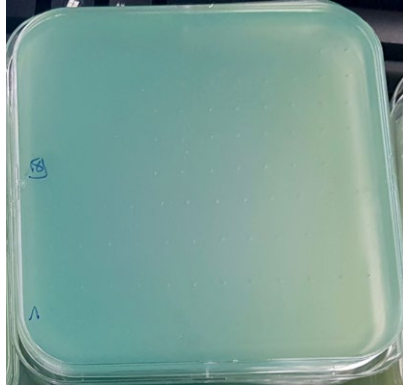
FIG. 11.2 Petri dish containing a nutrient medium and a bacterial strain. After 24 hours in an incubator at 37°C, a uniform opacity can be observed due to the development of the strain, which forms a mat.