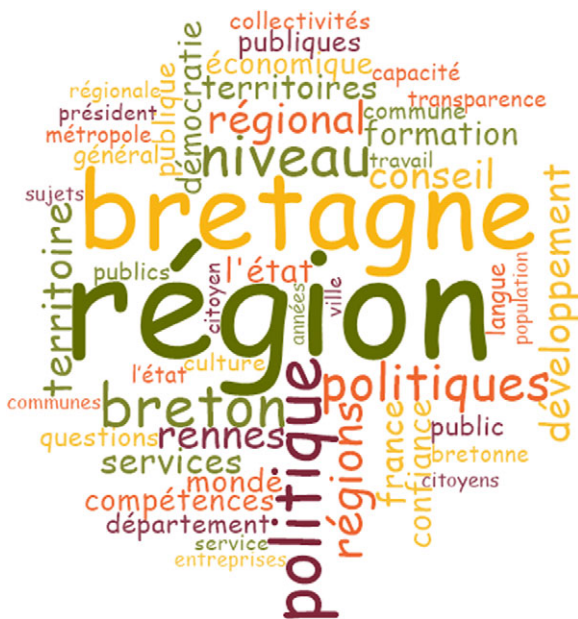
Figure 1. Making Sense of the Region in Brittany: the Breton Word Cloud, 1995–2017

politiques (policies), régions (regions), régional (regional), territoire (territory), and Rennes (city of Rennes).