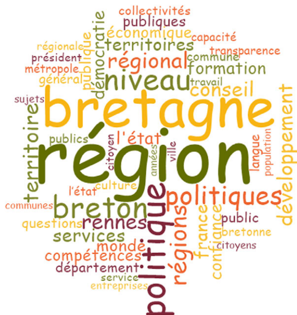
Figure 1. Making Sense of the Region in Brittany: the Breton Word Cloud, 1995–2017

politiques (policies), régions (regions), régional (regional), territoire (territory), and Rennes (city of Rennes).