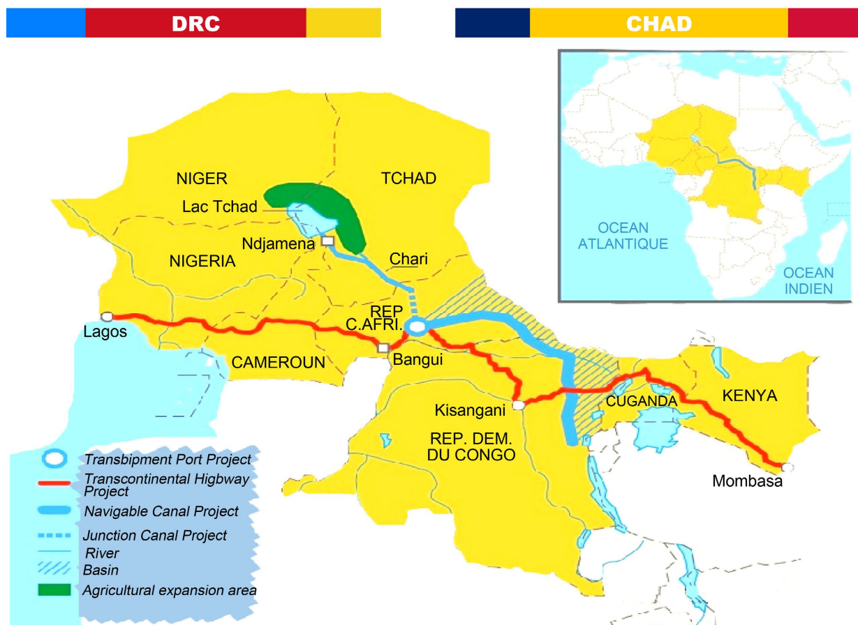
Figure 2. Transaqua project. ©2021 authors, inspired by Schiller Institute (Acheikh, 2015).

Secondly, and according to Bonifica’s original 1970 project proposal, Transaqua envisages the construction of a large navigable canal of 2400 km between the Congo River and Lake Chad, which would transfer 100 billion cubic meters of water per year—about 5% of the annual flow of the Congo River—to Lake Chad. It therefore aims to link the Congo Basin to other African countries and to two seaports [Mombasa and Lagos] by a navigable canal [transport and trade networks] (see Figure 2). It also plans to build a series of hydroelectric stations