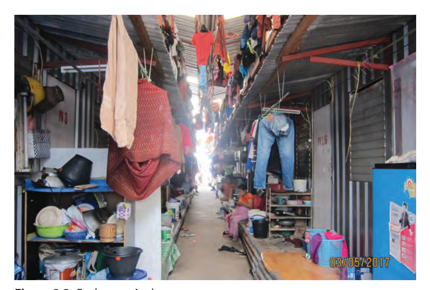
Figure 2.3: Enclave on Asok

The criteria that originally governed the choice of these urban enclaves have generally remained constant from one year to the next. I say "originally" because between 2014 and 2019, a period corresponding to data collection for this chapter, things changed considerably, with an exponential increase in the number of enclaves and migrant workers. This does not call into question the specificity of the enclaves, but a few material variants indicate a change of scale: the increasing number both of migrant workers and larger enclaves are taking on an industrial dimension. Alignments of superimposed containers have appeared. Compared to the corrugated iron barracks, the space allocated to the workers is a little larger, above all higher, but this does not translate into more comfort, rather the reverse, because the rooms in the containers become dormitories with only a single entrance and exit. The new presence of these container accommodations testifies to the structured mobility affecting the enclaves and their residents.