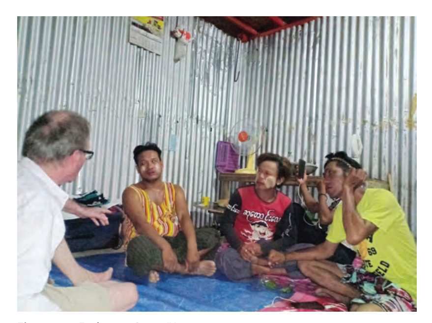
Figure 2.4: Enclave on Rama IX

"Disposable" is fifth. This was how migrant workers felt, like something inexpensive and replaceable, when on March 23, 2020, 9,000 of them rushed back to the Thai-Myanmar border before it was closed by the Thai authorities at the beginning of the COVID-19 pandemic. Unlike factories of the industrial zone at the outskirts of the megalopolis, construction sites were not interrupted. Under these conditions, the massive return of migrant workers included only a marginal proportion of enclave residents, despite the increased risk of COVD-19 infection due to the promiscuity that reigns in the enclaves. But these five qualifiers are certainly not exhaustive; we could add "precarious", "insecure", "violent", "diffuse identity" etc. But whether it concerns the real estate plots on which the enclaves are built, the rotation of work teams and the workers themselves, or even the separation of families and obstacles to any form of communitarianism, everything contributes to distinguishing the enclaves of the city center from any other form of exile living condition. Their territorial isolation is combined with social isolation, a trend further reinforced by the social distancing that the residents of the enclaves maintain with regard to the associative offer.