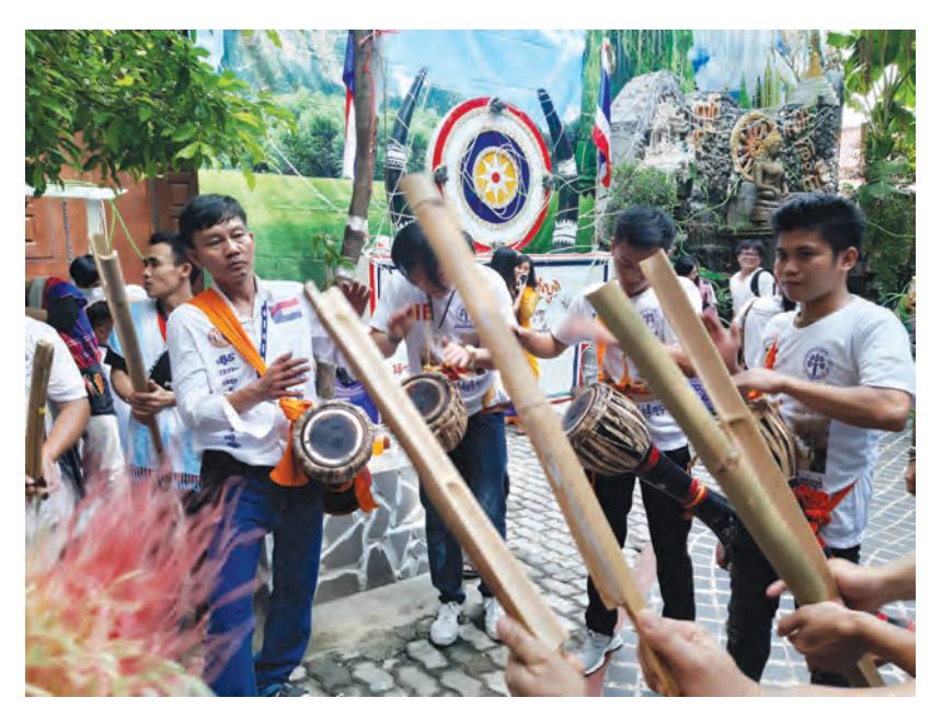
Figure 2.5: Karen ceremony at Wat Nakhon

precariousness.<sup>11</sup> In his reference book The Cosmopolitan Condition , Michel Agier reminds us that the intrinsic fragility of any community ideal requires reactivating the community tie at regular intervals (2013a, pp. 32-33). From a sociological point of view, rituality and cyclicality are the modus operandi ; if these renewed opportunities for social integration are shattered or disintegrated, it is the whole system that is undermined.