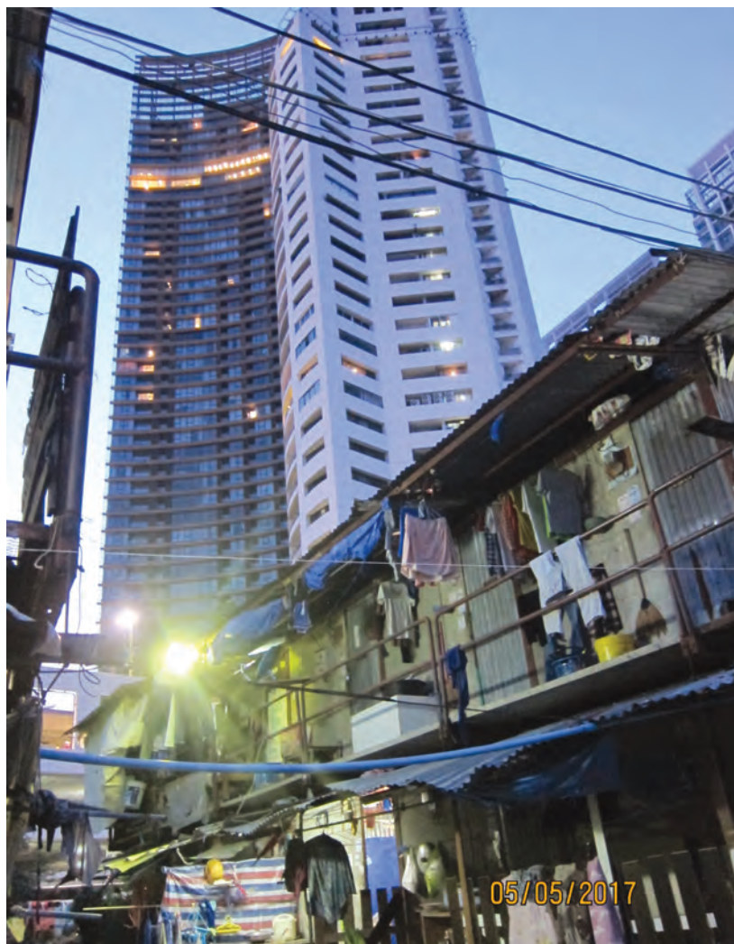
Figure 2.2: Enclave on Sukhumvit

workers' towns and corporatist districts that Pongsawat (2007) describes as "cities in the city" and precarious habitats of a new kind. Sieng-Kong Bangna (เซียงกงบางนา) in southeast Bangkok is just one example. This and the enclaves like it are unexpected consequences of geopolitics in motion. In what follows, I will show that their geographical position in the city center combined with the rules imposed by employer companies on residents constitute the main distinctive features of the enclaves.