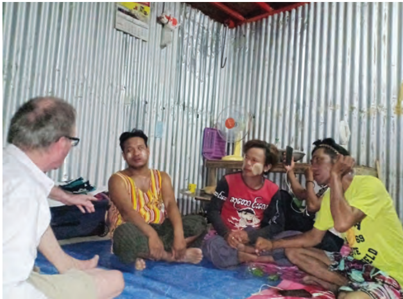
Figure 2.4: Enclave on Rama IX

“Disposable” is fifth. This was how migrant workers felt, like something inexpensive and replaceable, when on March 23, 2020, 9,000 of them rushed back to the Thai-Myanmar border before it was closed by the Thai authorities at the beginning of the COVID-19 pandemic. Unlike factories of the industrial zone at the outskirts of the megalopolis, construction sites were not interrupted. Under these conditions, the massive return of migrant workers included only a marginal proportion of enclave residents, despite the increased risk of COVID-19 infection due to the promiscuity that reigns in the enclaves. But these five qualifiers are certainly not exhaustive; we could add “precarious”, “insecure”, “violent”, “diffuse identity” etc. But whether it concerns the real estate plots on which the enclaves are built, the rotation of work teams and the workers themselves, or even the separation of families and obstacles to any form of communitarianism, everything contributes to distinguishing the enclaves of the city center from any other form of exile living condition. Their territorial isolation is combined with social isolation, a trend further reinforced by the social distancing that the residents of the enclaves maintain with regard to the associative offer.