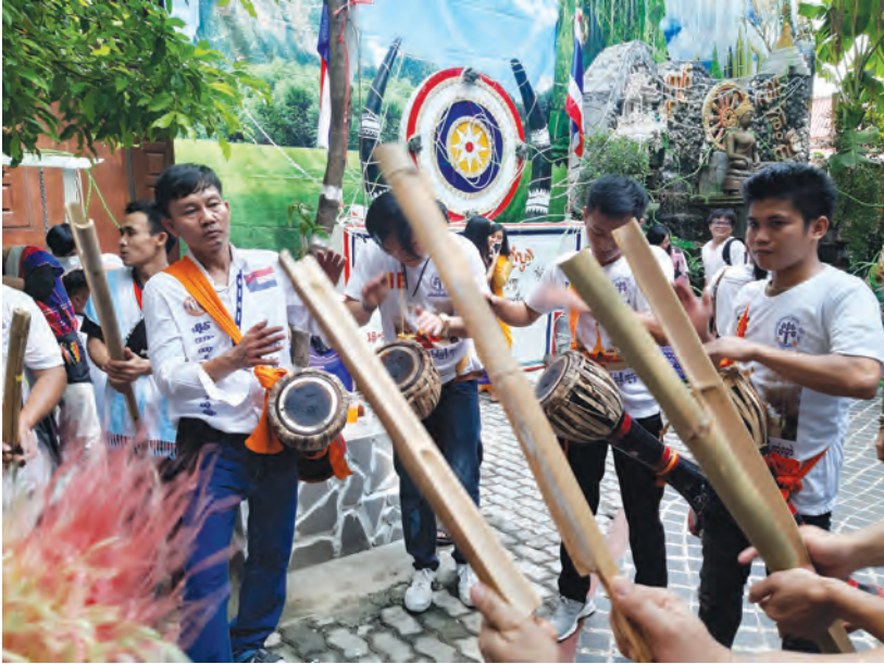
Figure 2.5: Karen ceremony at Wat Nakhon

precariousness. 11 In his reference book The Cosmopolitan Condition , Michel Agier reminds us that the intrinsic fragility of any community ideal requires reactivating the community tie at regular intervals (2013a, pp. 32-33). From a sociological point of view, rituality and cyclicity are the modus operandi ; if these renewed opportunities for social integration are shattered or disintegrated, it is the whole system that is undermined.