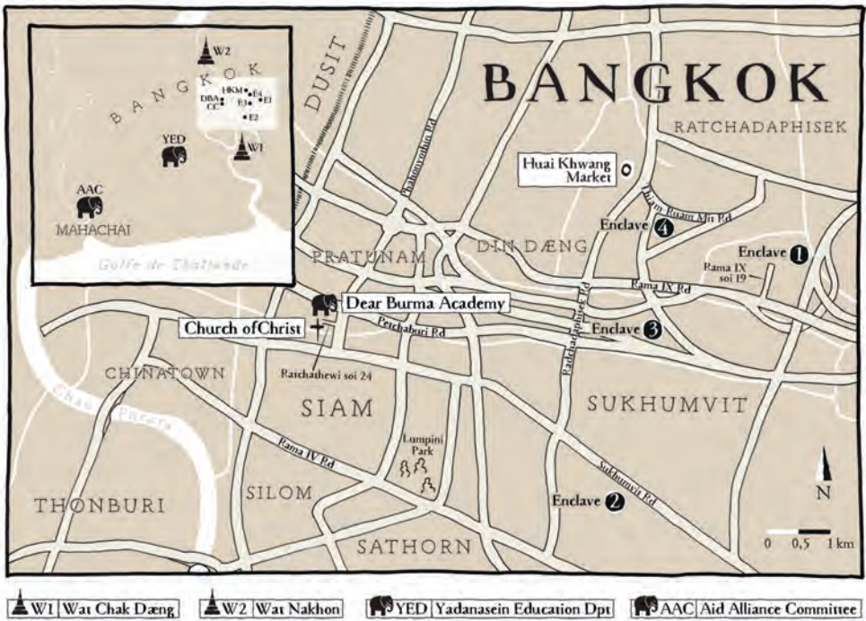
Figure 2.1: Map of Bangkok annotated with areas referred to in the chapter, created by Jean-Luc Didelot

Keywords: Bangkok enclaves, transnational migrant workers, cosmopolitan condition, consistency of social crossroads, associative mediation, multiple mobilities, remittance, indebtedness, social distancing policy, territories of desocialization.