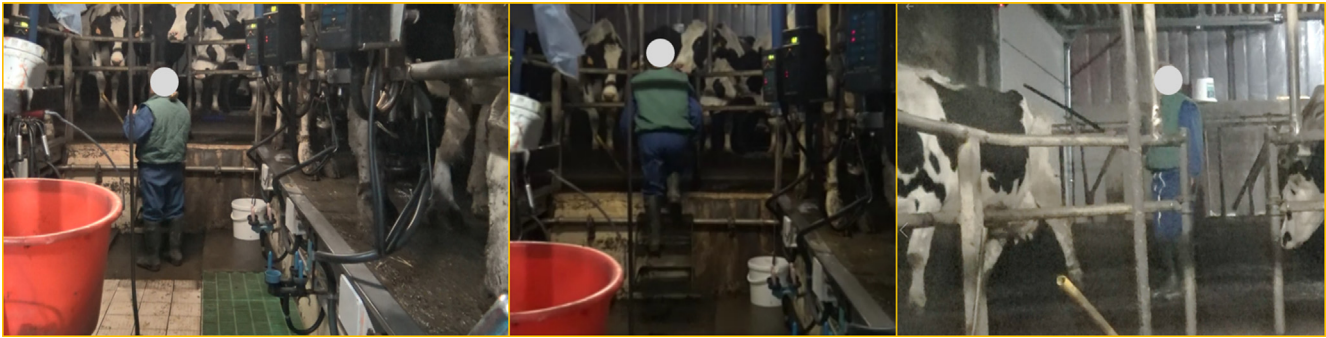
Fig. 2. Human intervention in a milking parlour.