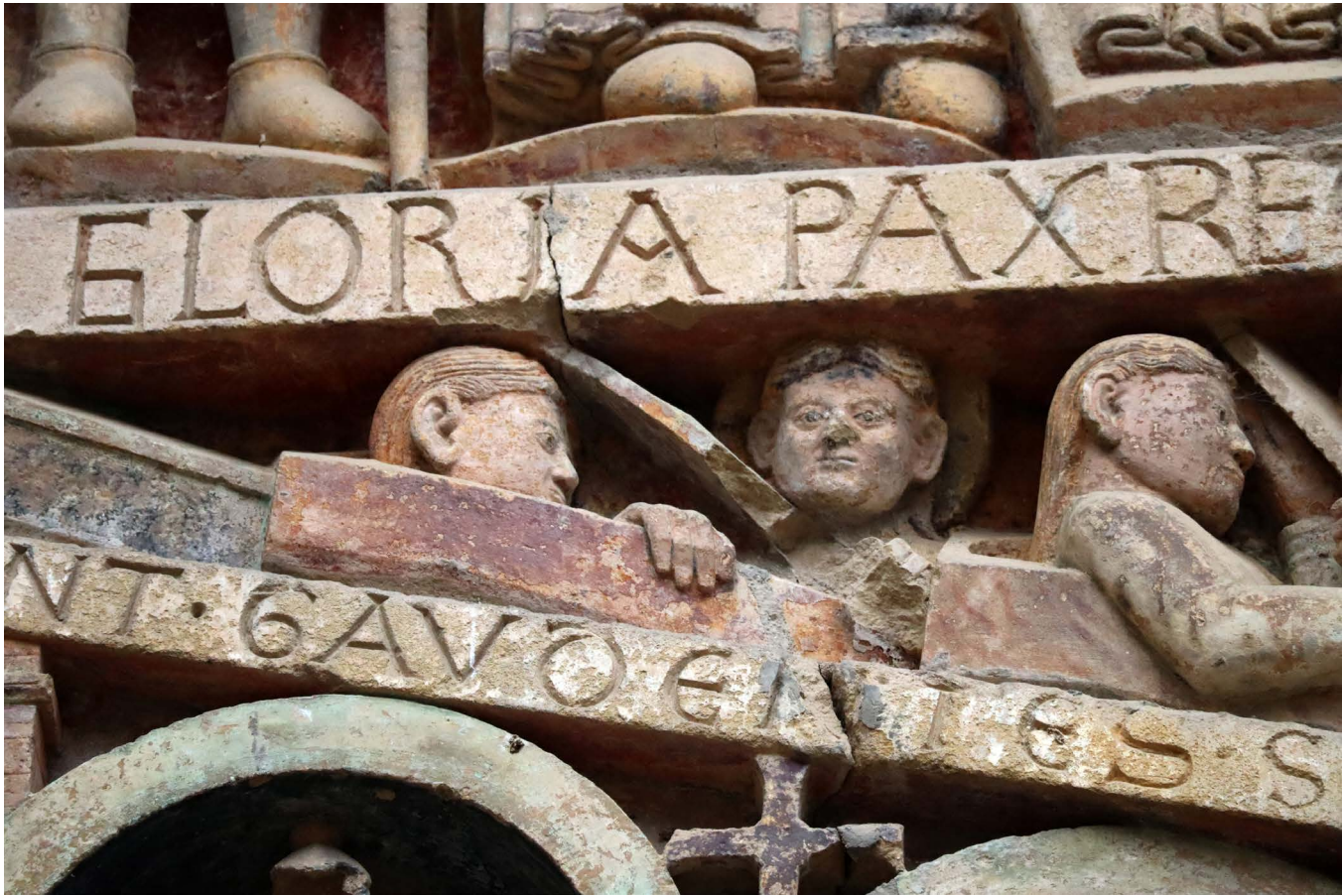
3/Detail of the sculpted portal with inscriptions, west façade, abbey-church of Sainte Foy, Conques, ca 1100

A real revival of interest in Conques heritage, especially its treasure, can also be identified in the first decades after the Second World War. This is, of course, due to the groundbreaking analysis by Jean Taralon (1909–1996) performed in this period 20 . But this interest should also be understood within another context: the reclaiming of interest in Catholic heritage and ethics on a European scale. In reaction to the horrors of the Second World War and the Nazis' misuse of the past, the shared Christian medieval heritage of Europe suddenly appeared to have a burning relevance. It is also within this framework notably promoted by Christian intellectuals, that the idea of a united Europe was constructed based on its Christian roots 21 . The interest in one of the most impressive medieval treasures surviving until today in France should thus be understood against the backdrop of a newly-constructed European unity. It is not surprising that, decades later, the already-established European Union would choose the Santiago pilgrimage roads