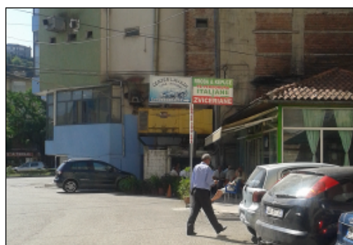
Photo No. 8 – Second-hand clothing store from Italy and Switzerland.