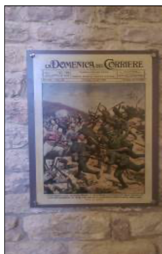
Photo No. 11 – La Domenica del Corriere in the castle of Gjirokastrë.