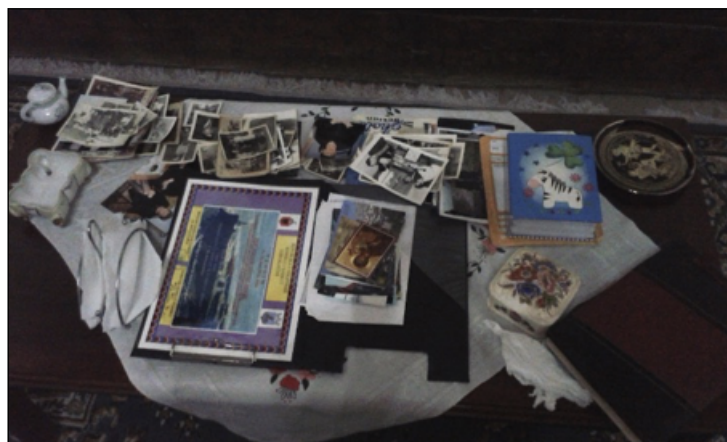
Photo No. 15 – Distant past photos together with the new album displayed on the table.

relatives who are absent due to migration into the everyday life of those left behind and guarantee a sort of continuity to the family in its place of origin.