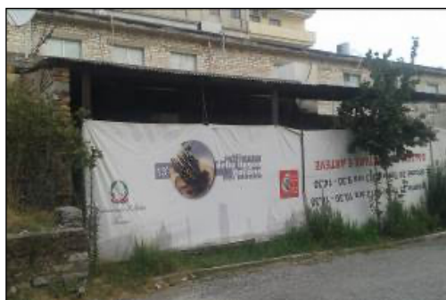
Photo No. 9 – ‘Week of the Italian Language in the World’ upside-down banner.