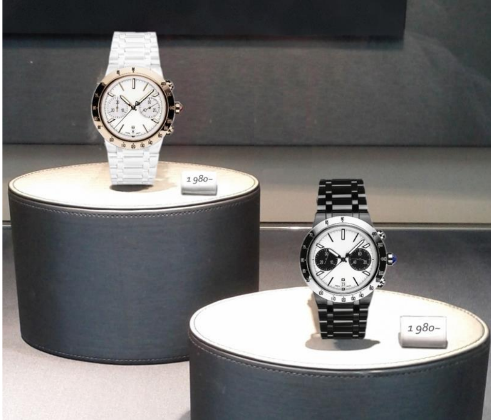
Figure 1 Illustration of the experimental stimuli

To measure brand luxury, the study used five items among the most frequently used in the literature to measure non-personal-oriented perceptions of brand luxury (Christodoulides et al. , 2009; Conejo et al. , 2020): “Not luxurious – Luxurious”, “Poor quality – Best quality”, “Popular – Elitist”, “Everywhere – Exclusive” and “Inferior – Superior”. According to Vigneron and Johnson (1999), non-personal-oriented perceptions of luxury brands (i.e., perceived quality, perceived uniqueness, and perceived conspicuousness) are price-driven, while personal-oriented perceptions of luxury brands (i.e., perceived extended-self and perceived hedonism) are consumer-driven, explaining why we concentrated on the former. To measure anticipated guilt, we borrowed three items from Lee-Wingate and Corfman’s (2010) scale (e.g., “How guilty / uneasy / hesitant would you feel about spending money on purchasing one of these watches?”).