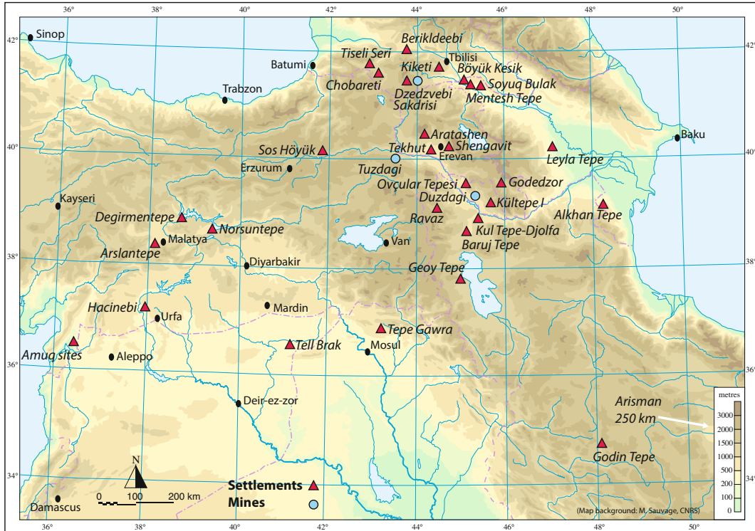
Fig. 1 – Caucasian prehistoric mining works in their regional context (map background: M. Sauvage, CNRS).

One of the underlying aims of our work at Duzdağı was to discover why the exploitation of salt had not begun until the second half of the 5th millennium: since this question is possibly linked to increasing pastoral activities resulting from zotechnological innovations (wool production and dairy products), an in-depth study of subsistence strategies was also carried out, which included the analysis of pastoral systems and pastoral routes. Several mobile camps located in the mountains opposite the salt mine, such as Zirinçlik and Uçan Ağıl, were thus investigated.