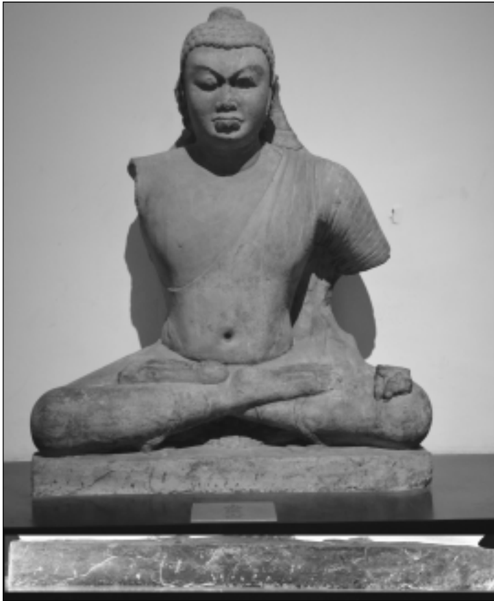
Inscribed image of Buddha dated in the 64th year of king Trikamala.