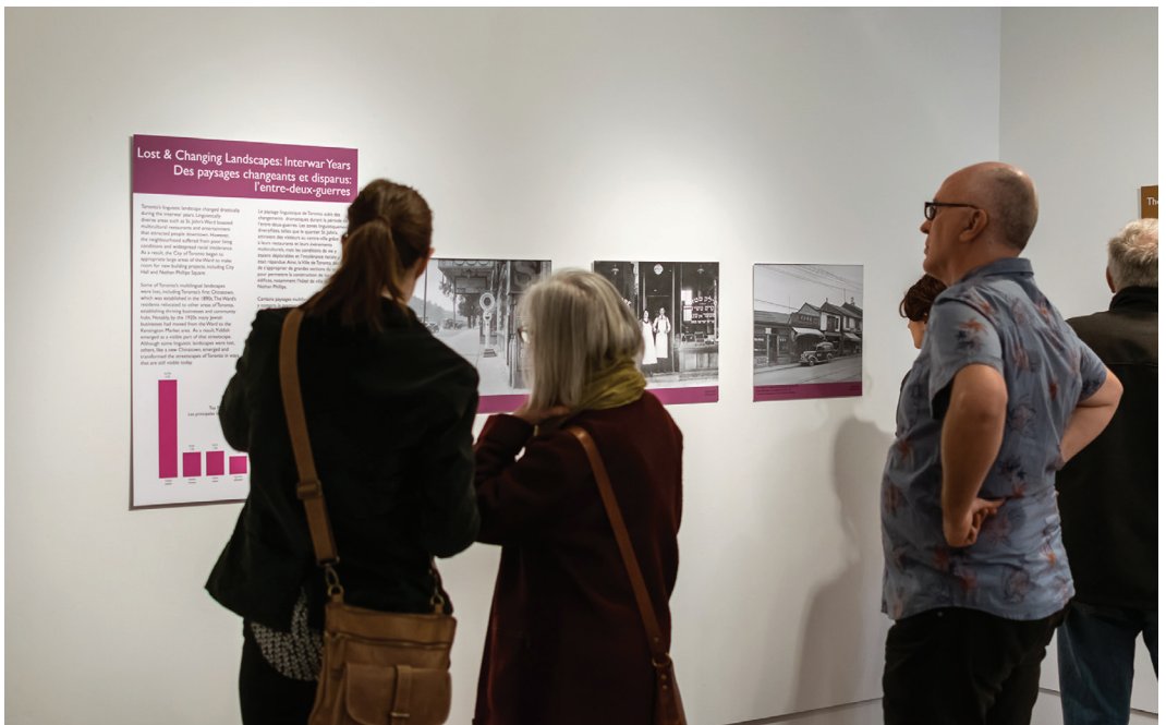
Figure 6: Read Between the Signs: 150 Years of Language in Toronto. CLM Exhibit in Glendon Gallery, May 2017.

EG: Our focus has been on having the exhibits travel in Canada, and so they have only been out of the country twice. I took our first exhibit, Canadian English, Eh? to a large academic conference in Boston, the Linguistic Society of America (LSA) conference, where I found that most of the interest came from the Canadians present. More recently I took the exhibit Cree: The People's Language to the International Year of Indigenous Languages 2019: