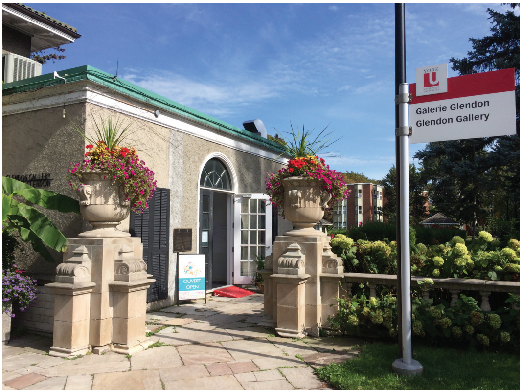
Figure 2: Glendon Gallery exterior September 2019.

We were delighted to discover that there is huge interest in the Canadian public in language. Canada is a diverse country, and not only are people proud of their own languages and heritage but they are genuinely excited about learning about other languages as well. We've had very enthusiastic responses to our exhibits and a constant stream of suggestions about other languages we should focus on. We have strong followings on our social media accounts: one