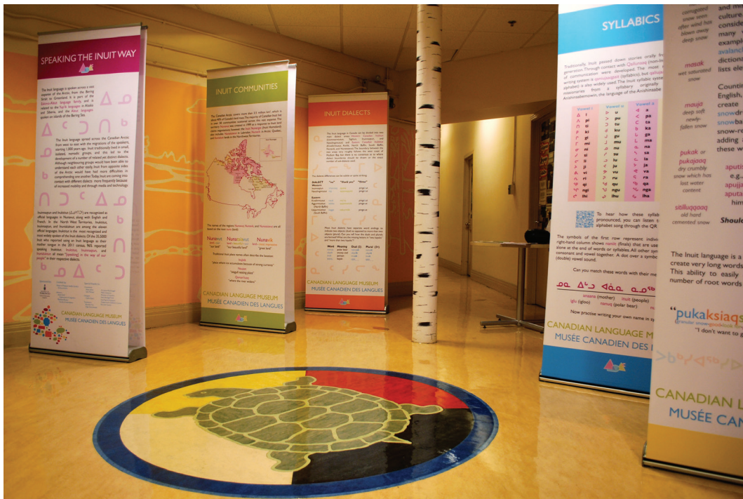
Figure 3: Speaking the Inuit Way . CLM exhibit in Centre for Indigenous Studies, University of Toronto, June 2014.

In order to make the exhibits as accessible as possible, we do not charge an entrance fee to our exhibit space. Entrance to most of the venues where our travelling exhibits are shown is free as well. The CLM’s exhibits have been hosted at over 30 university and college campuses, at more than 25 libraries across the country and been part of over 35 conferences, symposia and festivals. Many venues have hosted several exhibits over the years. It is especially gratifying to be able to bring these exhibits to where people live, in small and large communities across the country. Our exhibits are shown in public spaces such as libraries, community centres, municipal buildings and schools – places