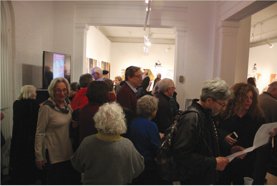
Figure 5: Yiddish Spring . CLM Exhibit in Glendon Gallery. April 2019.