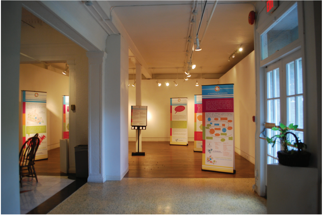
Figure 9: Le français au Canada . CLM Exhibit in the back exhibit space. Canadian Language Museum, Glendon Gallery, 2016.

MT: I understand that 2021 will be the CLM's tenth anniversary. What are your hopes for the next ten years for the CLM?