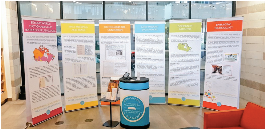
Figure 8: Beyond Words: Dictionaries and Indigenous Languages . CLM Exhibit in Markham Public Library. July 2019. Permission from library.

When I was first starting out, I looked to the National Museum of Language in the USA as an example of a small language museum, and I tried to learn both from their strengths and weaknesses. The CLM is a member of both the Ontario Museum Association and the Canadian Museum Association, and I have learned a lot about directing small museums from their members (Gold 2017). I have also attended two international meetings of language museums and am a founding member of the International Network of Language Museums. I have been inspired by programmes and exhibits in other language museums, such as the interactive exhibits in the Lithuanian Hearth, among others. I am in close communication with the founders of the new Eurotales project in Italy, and they have taken ideas from the CLM for their own work. In December 2019, the first book about language museums was published, Museums of Language and the Display of Intangible Cultural Heritage (Sönmez et al. 2020) and includes a chapter I wrote entitled 'The Canadian Language Museum: Developing travelling exhibits' (Gold 2020).