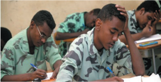
Figure 29: Sudanese boys in school uniform in 2015. 16