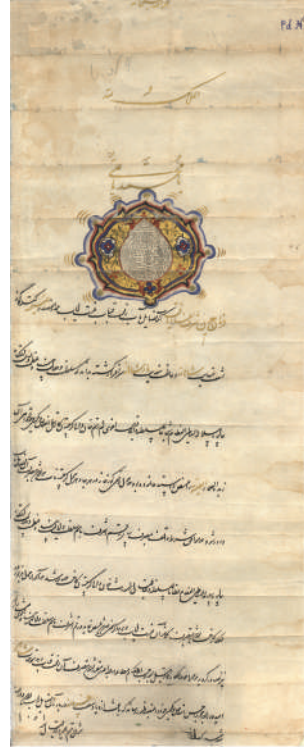
Figure 1. Pd-4, 1642, Illuminated Documents , p. 168.

Two other documents with similar content about granting, confirming, and reconfirming the ownership of properties to the catholicoses of Kartli and Kakheti were issued in the eighteenth century by Shah Sultan Husayn (r. 1694–1722). These documents have been preserved at the National Centre of Manuscripts. One of them is Pd-47 (issued in 1708; see Figure 2), 8 which presents Shah Sultan Husayn’s decree to the authorities of Kartli and Kakheti about granting estates which