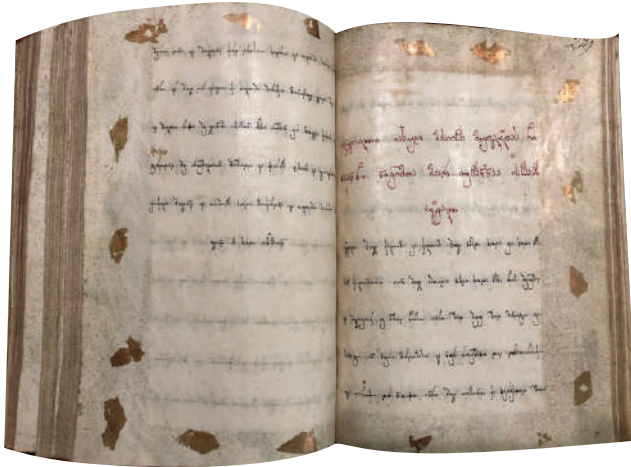
Figure 7. S-16, seventeenth or eighteenth century, 278v-279r.

Each page of the manuscript is spotted with gold ink. On the borders, spots are more frequent, serving as settings for the text. Golden rhomboid figures are used for ornament on some pages, and blue figures are also found (Figures 7 and 8).