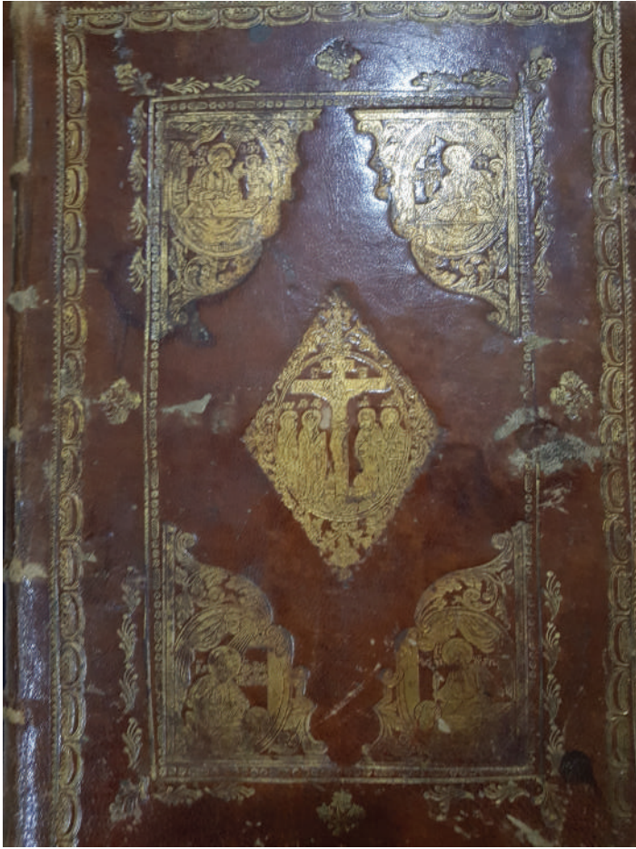
Figure 6. S-16, seventeenth or eighteenth century, book cover. Reprinted by permission of the Korneli Kekelidze National Centre of Manuscripts.

The manuscript contains all four Gospels, but it lacks the last part of Mark's Gospel. The handwriting is in the Georgian script, Mkhedruli. The ink is black, with the titles written in red ink. Some Persian phonemes are specifically expressed by Persian letters and signs (ء, ۀ). 23