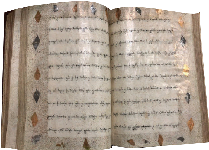
Figure 8. S-16, seventeenth or eighteenth century, 216v-217r. Reprinted by permission of the Korneli Kekelidze National Centre of Manuscripts.