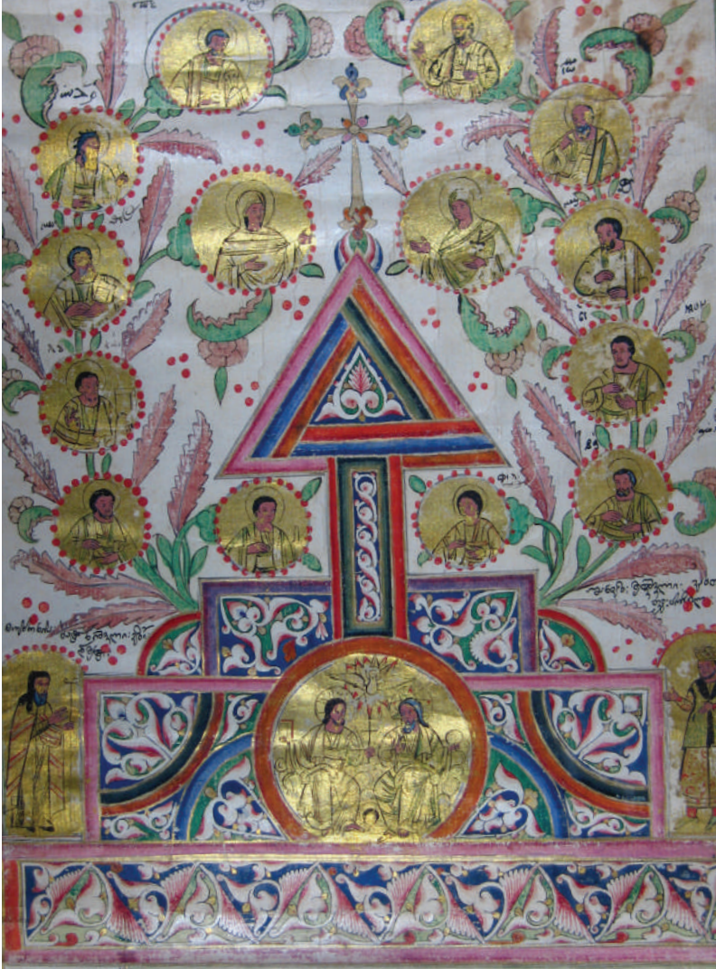
Figure 4. Ad-1837, 1670, Illuminated Documents , pp. 88–89.

the twelve Apostles in the upper margins; the Holy Trinity in the middle; and Archil II, who was the king of Kakheti (r. 1664–75), and Domenti III, who served as a catholicos from 1660 to 1675, in the lower margins.