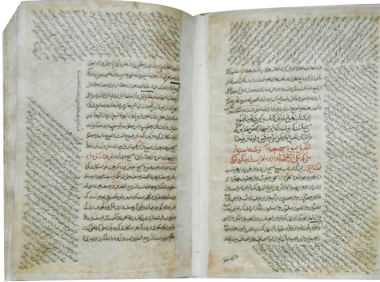
Figure 9. Persian Gospel, PK-55/90, seventeenth century, pp. 4v–5r.

a refined nasta'liq . The headings are in red; the text is embedded in a colored frame. 27 See Figure 9.