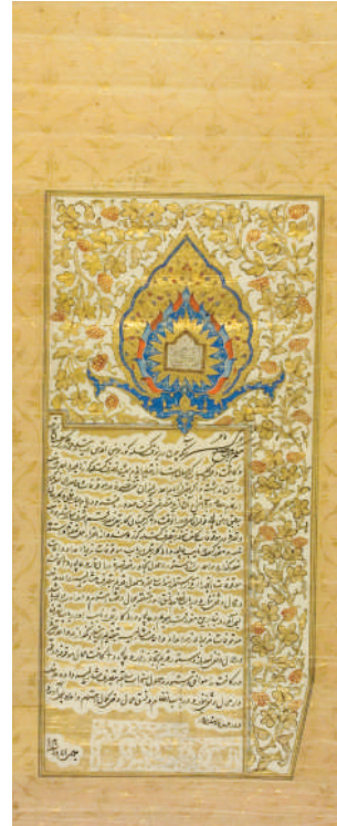
Figure 2. Pd-47, 1708, Illuminated Documents , p. 192.

Bilingual documents express the loyal policy of Iranian shahs to Georgian high priests, implying administrative rights and liberties. In Persian texts, more privileges are given to the Church than in the Georgian counterparts of the same documents. This expressed "compromise policy" connected with the reign of Rostom Khan