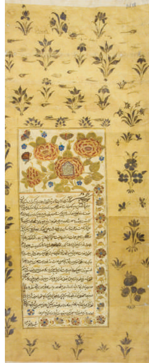
Figure 3. Pd-48, 1713, Illuminated Documents , p. 197.

Among these unique bilingual documents, which were issued by Christian sovereigns and allowed by the shah's supremacy, the most distinguished is the document Ad-1837 11 (1670; see Figures 4 and 5) kept at the National Centre of Manuscripts. The document deals with confirming that lands located near the river Mtkvari belong to the main Christian Church, Svetitskhoveli Cathedral, and liberating the inhabitants of this region from taxes. The document is a scroll, the main text of which is in Georgian while the Persian text is a summary of the deeds written in calligraphic nasta'liq in irregular lines. The upper part of the document is illuminated. It contains images of