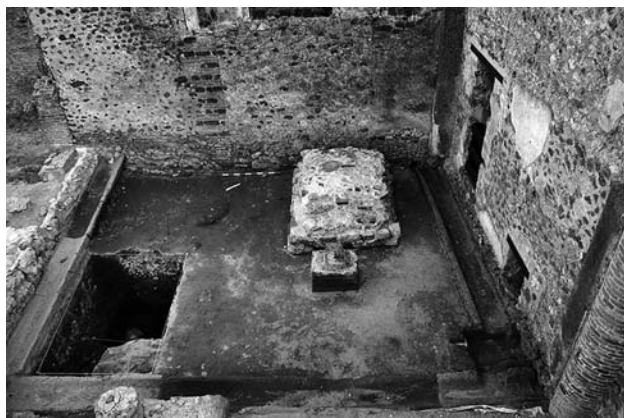
Fig. 1. Viridarium of the house VII, 6, 3 with the archaeological trial pit 1800-B (José María Luzón)