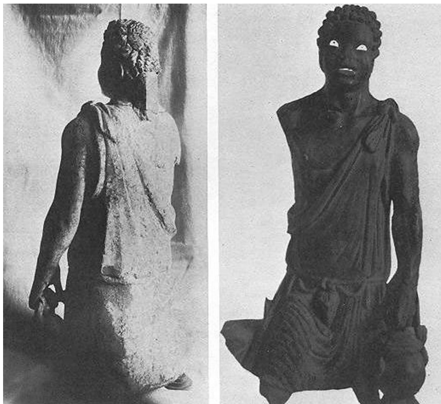
FIG. 5 Balneator (or slave at the baths) found in Afrosdias and now at the Musée du Louvre in Paris (Snowden, 1970, n. 117, p. 251).

Ethiopians, and also their literature and their material evidences reflect these interactions – examples of them are, above all, the so-called plastic head vases, sometimes Janiform 7 , or some interesting depictions in painted amphorae or vases. Romans began to take fluent contact with black people essentially since the defeat of Carthage. After this, Africa was annexed as a province and dark-skinned people started more frequent and long-term relations with the Roman population, in some cases becoming Roman themselves and even reaching high social positions.