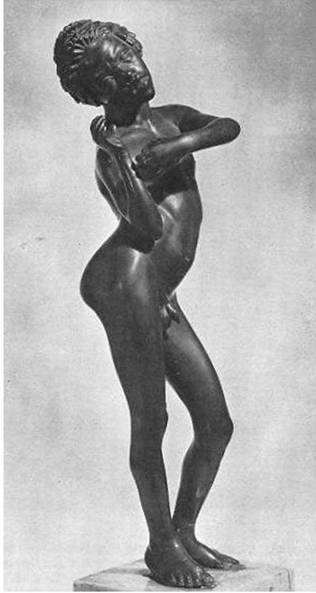
FIG. 2 Black musician from Chalons-sur-Saône, now at the Cabinet des Médailles of the Bibliothèque Nationale de France in Paris (Snowden, 1970, n. 60, pp. 84-5).

could have been the inception for creating this kind of iconographic topic 5 . They are not so common as, for example, the Galatian and German types, perhaps because the war in Africa was not so intense and long as in those other regions. However, we can find some examples of these figures at the Musée du Bardo (Tunis), which owns two hermaic pillars in black schist from the thermae of Antonine in Carthage: one of them representing an