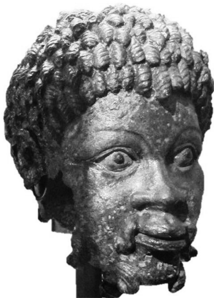
FIG. 4 Balsamaire in the shape of a head at the Cabinet des Médailles of the Bibliothèque Nationale de France in Paris (photo taken and edited by the authors).

actual Ethiopian and the other one interpreted as a portrait of a Libyan due to his special haircut. A similar model is kept at the Ashmolean Museum in Oxford, but it is currently regarded to as a mocking image 6 , maybe not representing in this case an enemy or a captive, as long as the treatment of the figure is totally different from that in the other two hermae . Another example of a defeated Ethiopian is the sculpture found in the Fayyūm , near Memphis, Egypt – now at the Musée du Louvre (FIGS. 6-7).