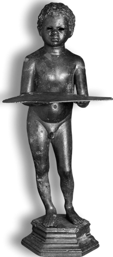
FIG. 1 Lampadarium representing a young black slave at the Museo Arqueológico Nacional de Tarragona.

in alexandrine style. Or another one in the Cabinet des Médailles in Paris. This is a balsamaire (a perfume vase) shaped like the head of an Ethiopian, in bronze (FIG. 4).