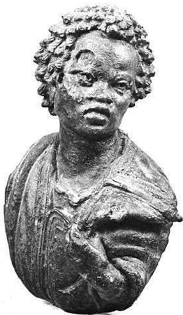
FIG. 3 A small bust of a black youth from Ostia, at the Museo Ostiense (Snowden, 1970, n. 53, p. 80).