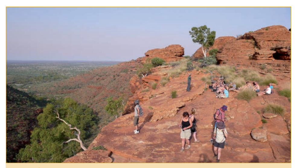
Photo 2/ Tourists visiting Kings Canyon in Watarrka National Park (Northern territory, Australia).