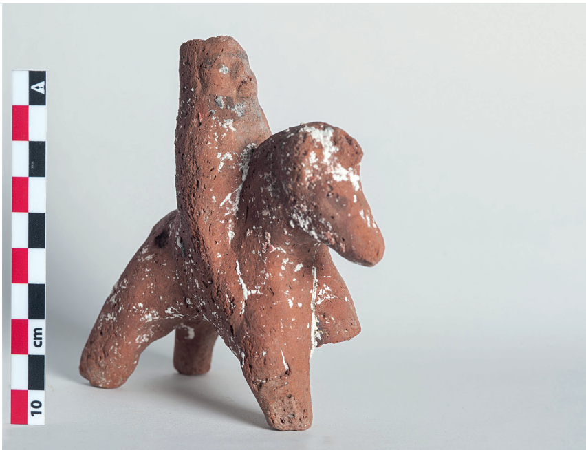
4. Persian rider in terracotta.