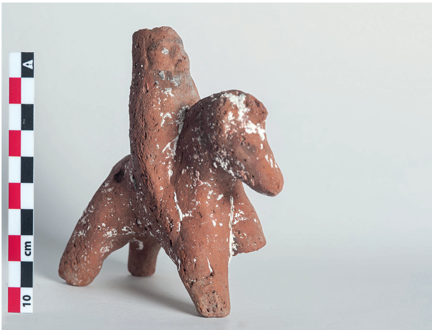
4. Persian rider in terracotta.