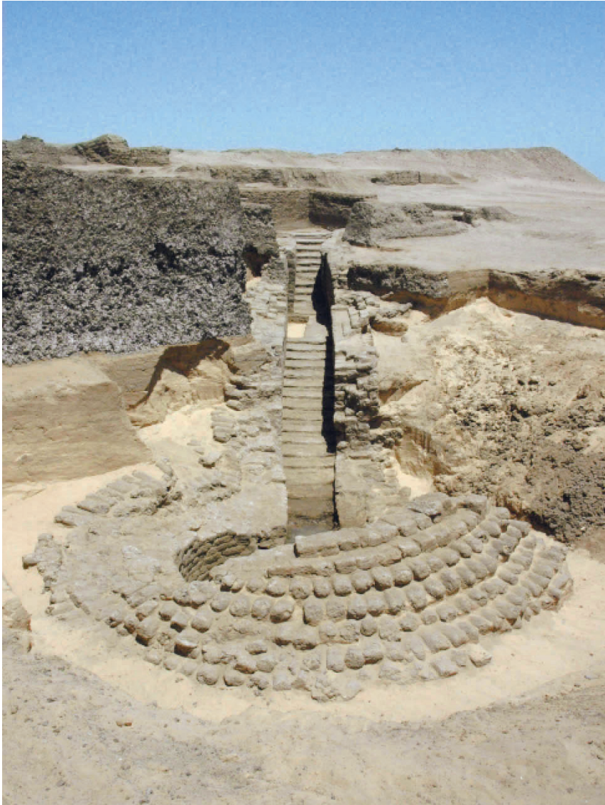
3. Hypogeum construction of the first half of the 5th century BC, north-east corner of the Tell.