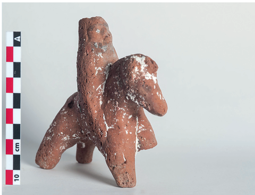
4. Persian rider in terracotta.