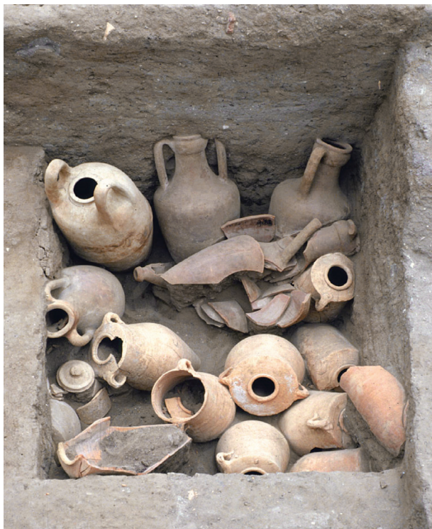
5. Amphorae deposit from the middle of the 5th century BC.

The first stepped enclosure, which formed a quadrilateral with sides about 140 m long, was probably constructed at the beginning of the 5th century BC. This was partially cleared on its eastern periphery during the first seasons of excavation. Also cleared were residential areas, temples with an atypical plan (axial niches and central altar) and huge, contemporaneous storage facilities whose cellars could contain dozens of wine and oil amphorae (these were unearthed in areas which had been particularly subject to destruction by recent military occupation). Entirely constructed of cylindrical bricks, a second, enlarged fortress, (with sides measuring 200 m) succeeded it in the last decades of the 5th century BC. This experienced several enlargements in the 4th century BC, and incorporated several blocks of dwellings accessed through a regular network of streets, cultic spaces as well as imposing buildings with a religious or administrative nature built on a cellular platform-foundation. At the north-west corner, a palatial-type of structure, with atypical, Near-Eastern, architectural characteristics, was accessed through a porticoed court which led to a long ceremonial room with annexes, as well as to a series of magazines.