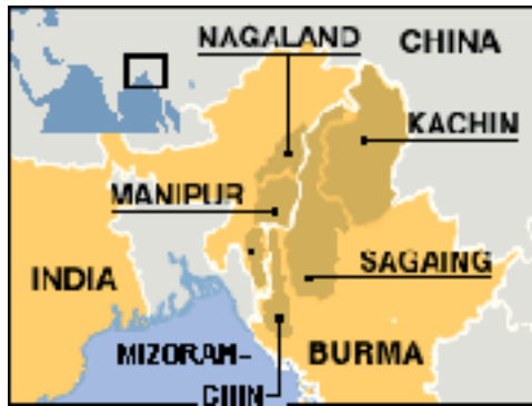
Figure 3: Neighbours: Northeast India and Myanmar's Provinces 30

The state of both the trade and trading posts along the Indo-Myanmar border leaves much to be desired with little central government initiative owing to the and Mizoram, are almost 100 percent literate states due to their history of Christian proselytization and the rise of Christian missionary educational institutions as a result.