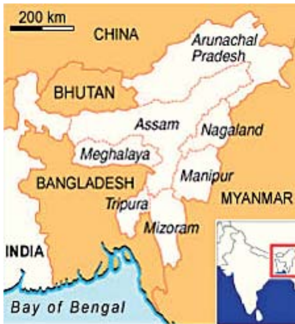
Figure 1: Northeast India and Myanmar 15

groups in the Northeast as part of their policy to keep India preoccupied in and tied down to South Asia. Among the beneficiaries of this Chinese policy – which continued until 1978 – were the Naga insurgent movement and the Assamese separatist movement led by the United Liberation Front of Asom (ULFA). The Nagas had in fact, declared their ‘independence’ in 1947, as the British were withdrawing from India but were dismissed as being of little consequence by the powers that be in New Delhi. This led them soon to take up arms and the movement remains one of the oldest insurgencies anywhere in the world 14 .