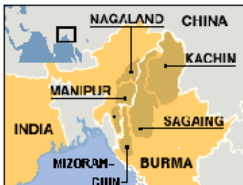
Figure 3: Neighbours: Northeast India and Myanmar's Provinces 30

The state of both the trade and trading posts along the Indo-Myanmar border leaves much to be desired with little central government initiative owing to the and Mizoram, are almost 100 percent literate states due to their history of Christian proselytization and the rise of Christian missionary educational institutions as a result.