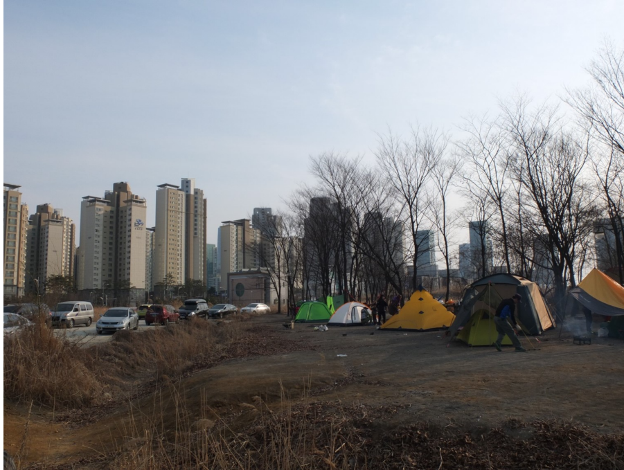
Figure 6: Photo of the barbecue area ( babekyu jang ) in 2014 28