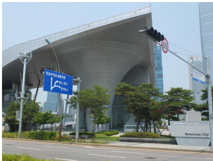
Figure 4: photo of “Tomorrow City” in 2016 24

Building a mega-project from scratch involves planning, which means that it develops in a manner different from that of an organic city built over time. A mega-project thus requires heavy marketing to hide its current state. For Songdo, being “smart” is not just a new means of adding to the city’s attractiveness, as could be said to be the case for London with the Canary Wharf (Murry 2015). Rather, being smart has to do with Songdo’s very model of conception. Planners believe that smart-city tools and the collection of big data will suffice to generate a successful organic city from scratch. However, there are discrepancies between the idea of the smart city and what has actually been built. For a new city, time passes differently. The narrative about Songdo has been accelerated to produce the image of being organic: keywords such as